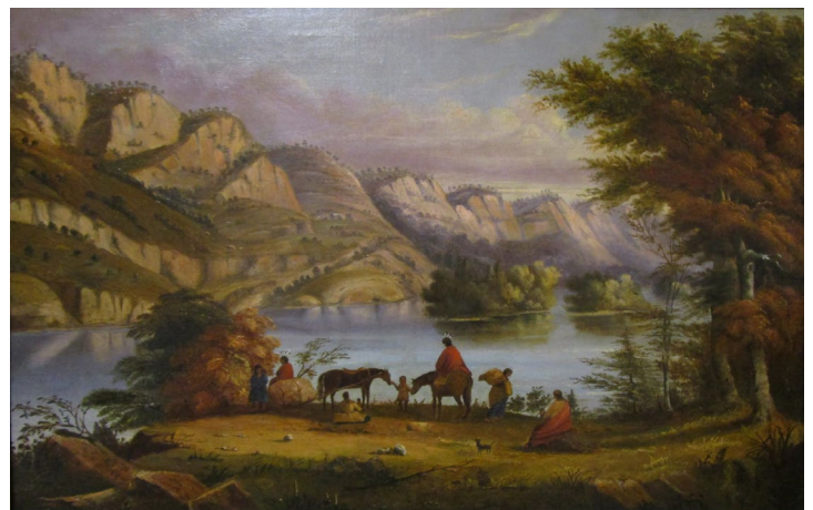
Henry Lewis (1818-1904) Indians on the Upper Mississippi , 1865, oil on canvas