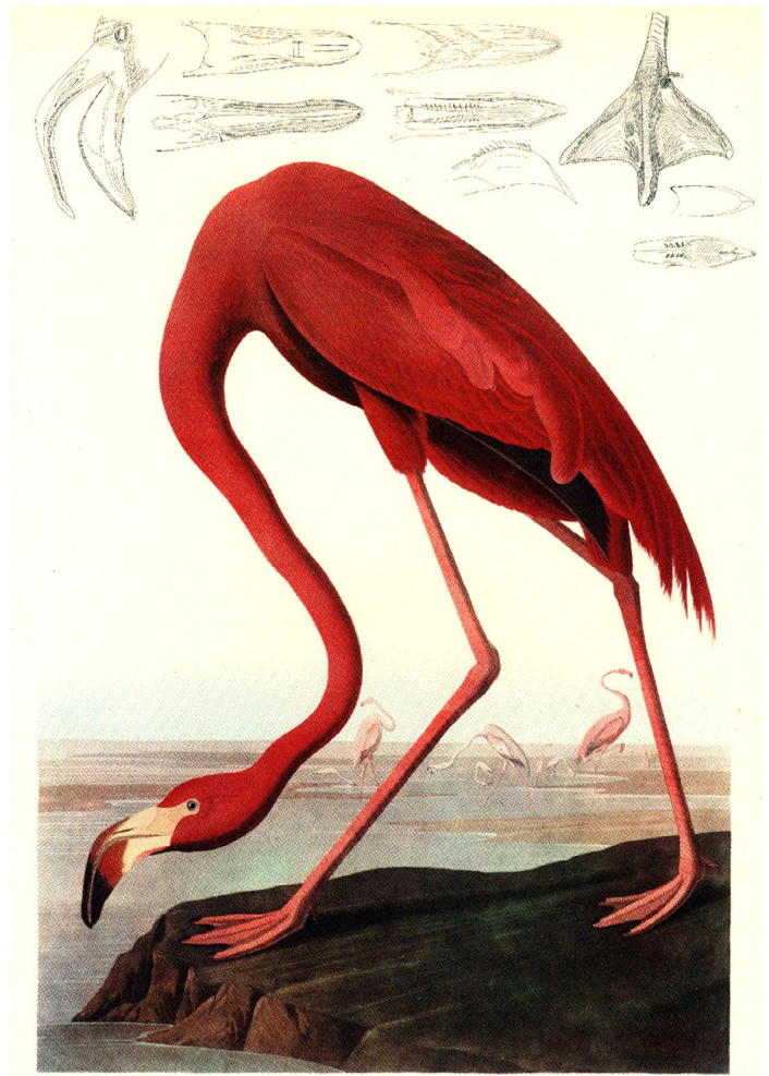
American Flamingo from Audubon's Birds of America