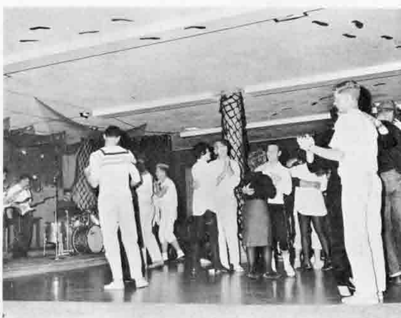
DRESSED IN TYPICAL beatnik attire, MUNRC students and guests dance to the music of the Starlighters at the "Bongo Blast", November 19.