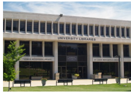
Thomas Jefferson Library