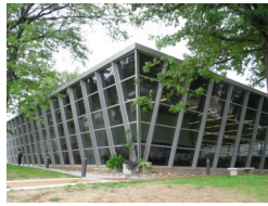
Ward E. Barnes Library