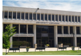
Thomas Jefferson Library