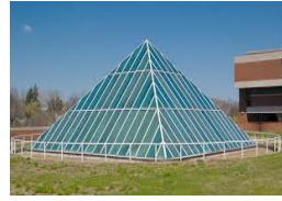
St. Louis Mercantile Library