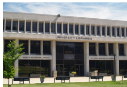
Thomas Jefferson Library