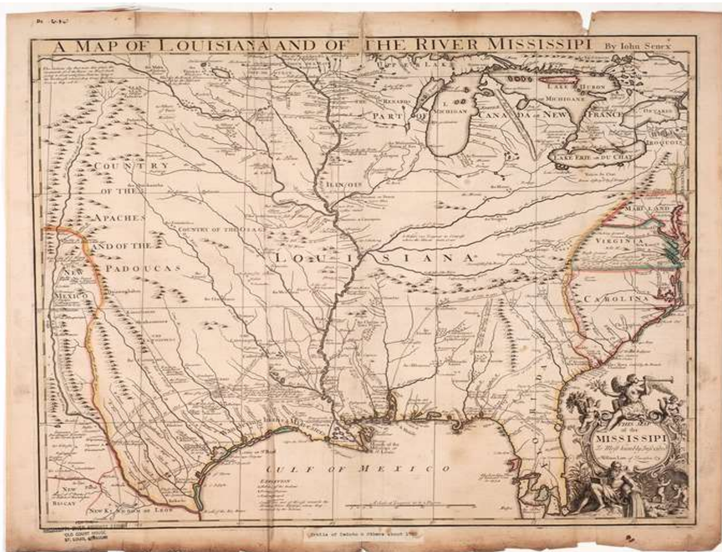
Appendix B. Map digitized for this project. National Park Service, JEF-10543. 1721 by John Senex."