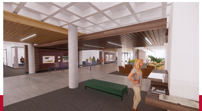
Concept art of a renovated Level 3

Please see our video sneak peek of some of the changes to come!