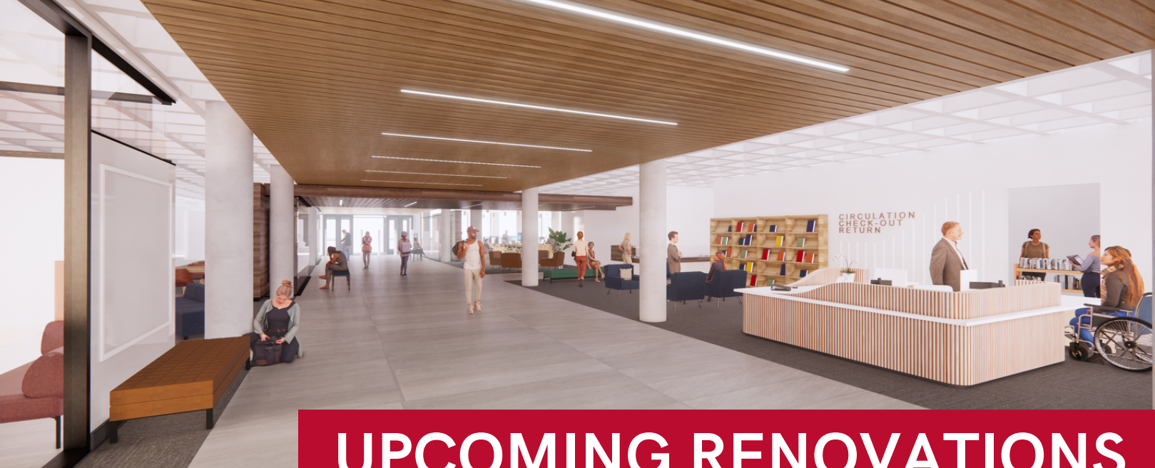
Concept art of a renovated Level 3