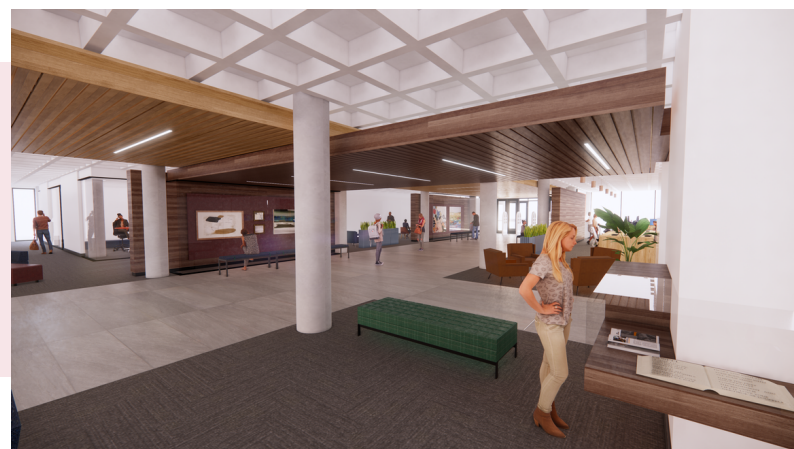
Concept art of a renovated Level 3

During the renovation, there may be spaces inaccessible to campus within the library. The whole of Level 5, including study rooms, is currently closed as we prepare the space for the contractors. If users need items from Level 5, you can place a request in the library's catalog. The item will be pulled, and the user will be notified to pick up the item at the main desk. Students and faculty who wish to use the library for meetings or study space will have Levels 1, 2, and 4 available.