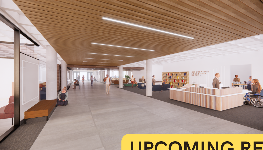
Concept art of a renovated Level 3