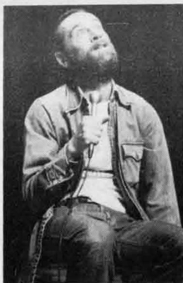
George Carlin last Friday.