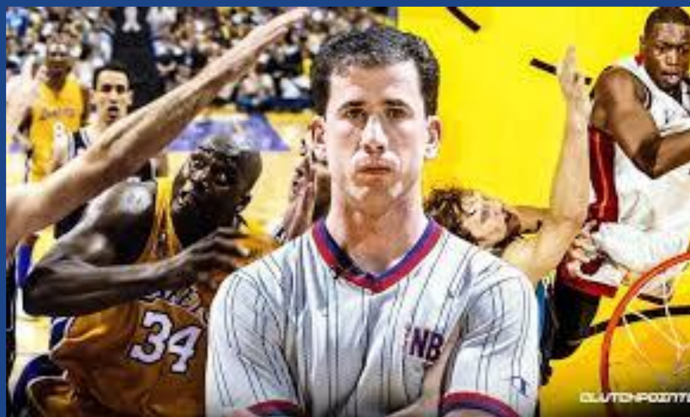
Referees are on record saying that they called game six of the 2002 finals in favor of the Lakers to extend the series to seven games.