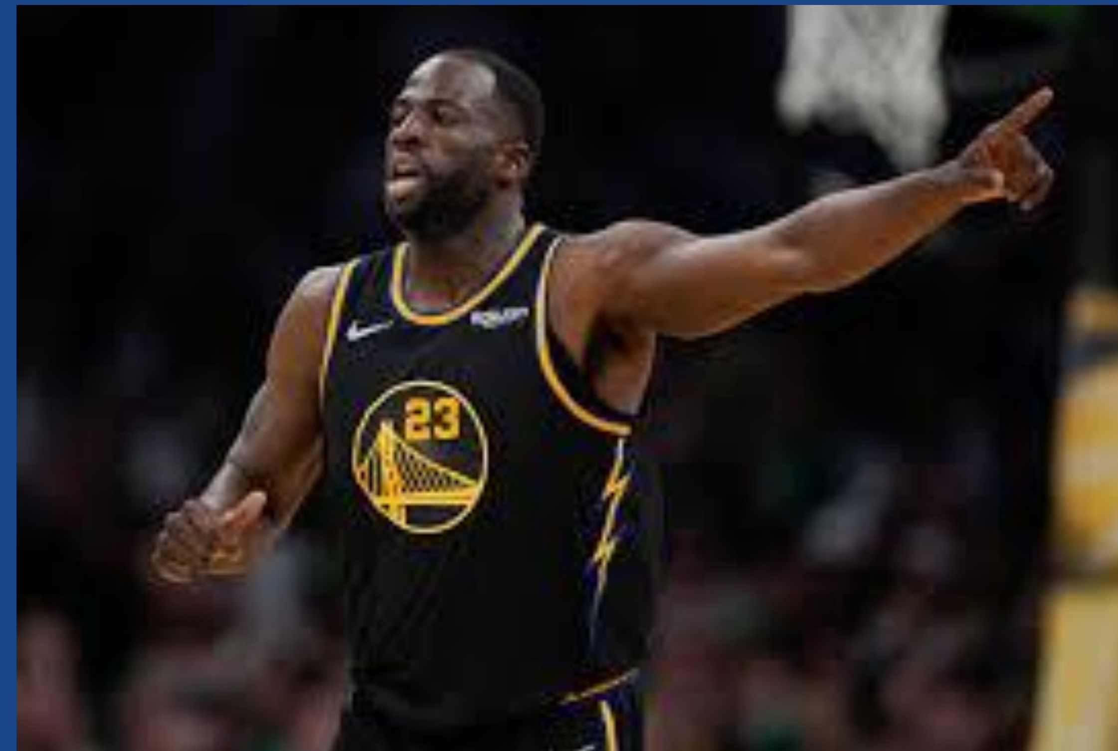
Draymond Green's suspension from game six in 2016 NBA finals possibly gave the Cleveland Cavaliers an advantage in the series