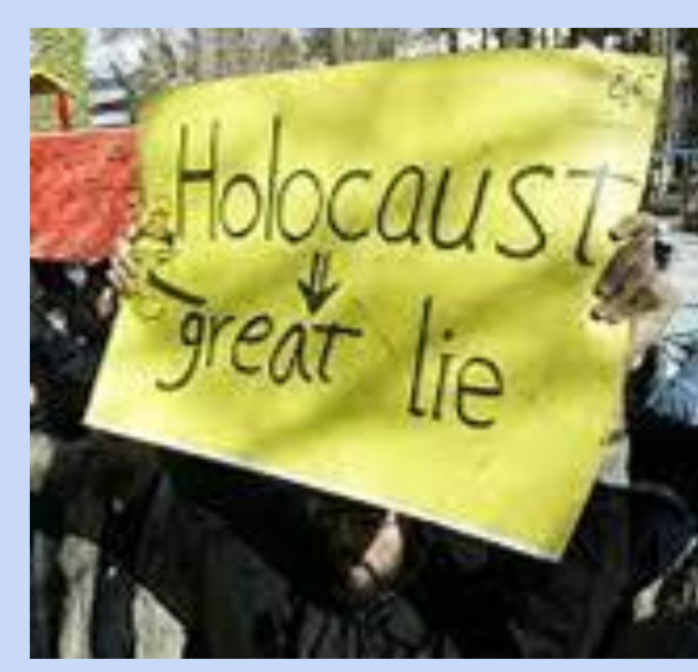
s://www.ushmm.org/online-calendar/event/VEFBSTAYCONDENIAL0920 This photo is from a protest in 2006 in Iran by a group of Muslim extremists.

Deniers make many claims, attacking and latching onto specific parts of the Holocaust to prove something is incorrect or inconsistent to prove the Holocaust was a hoax. Some central claims are: gas chambers were not used to kill Jews, and most deaths in the camps were caused by starvation and disease, the number of Jews that died was much less than six million, closer to 300,000 to 1 or 2 million, there was no intentional Nazi plan to annihilate the Jews, only to deport them.