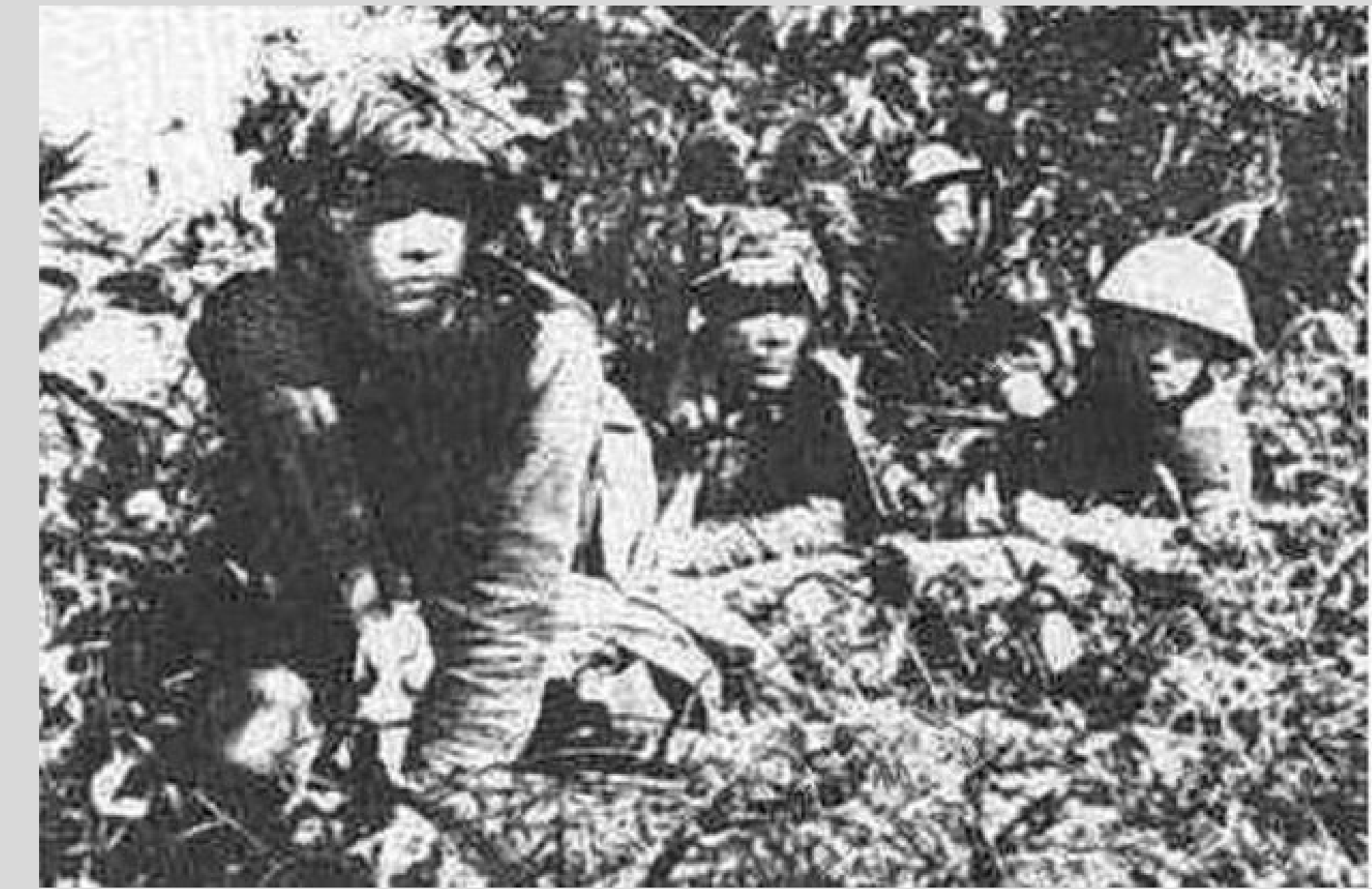
FIG 3-4: A comparison of two pictures of guerilla warfare, that of the Ewoks (left) and the Americans in the Vietnam War (right).