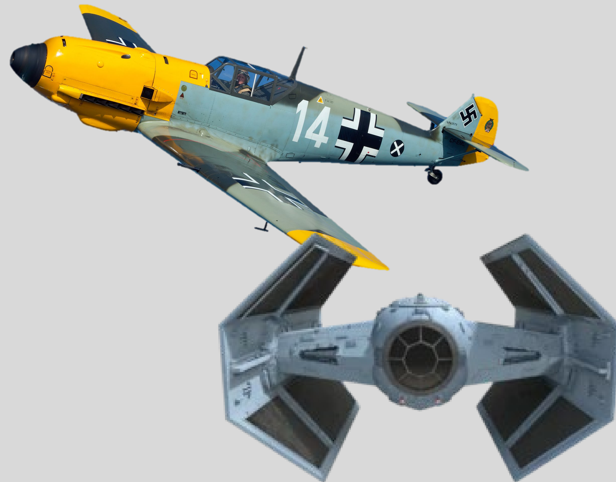
FIG 1-2: The Messerschmitt BF-109 (upper) and TIE Advanced X1 Fighter (lower) in comparison to each other. The Messerschmitt is the closest comparison for the TIE Fighter Series.