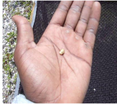
Illustration 2. Poisonwood seed collected in seed trap.