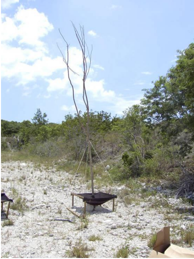
Illustration 1. Artificial perch with seed trap below and paired trap to the left.