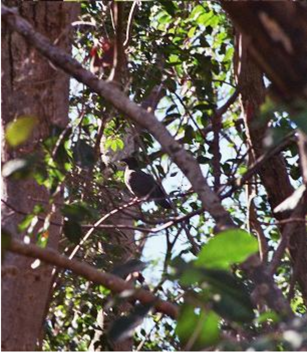
Illustration 3. White-crowned Pigeon within edge transect