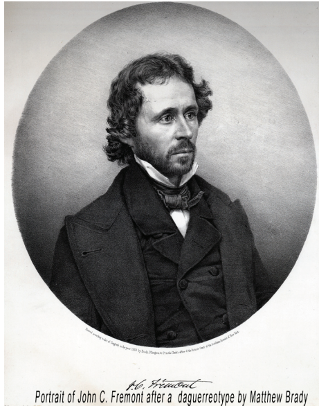
Portrait of John C. Fremont after a daguerreotype by Matthew Brady