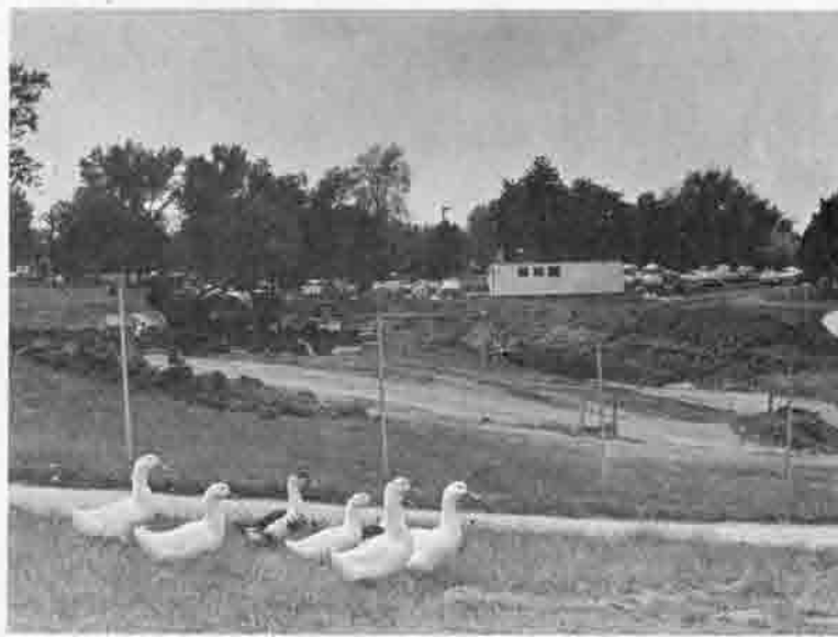
Even the duck population is growing! UMSL's feathered friends check progress at the Life Sciences site.