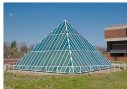
St. Louis Mercantile Library