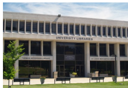
Thomas Jefferson Library