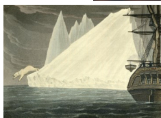
"A Bear Plunging into the Sea" (part of the "Audubon and Beyond" exhibit)

Do you have time between classes or need a break from studying? Visit the Mercantile Library and see their new exhibits opening this semester: