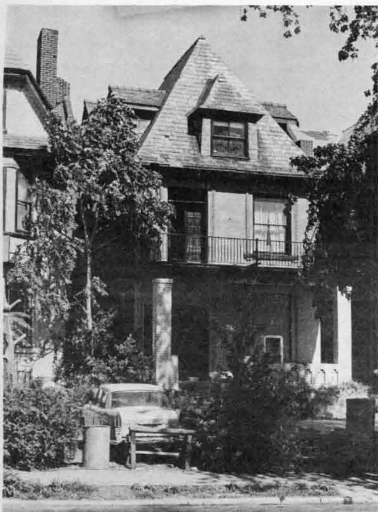
The sign prohibiting drugs that radio station KDNA claims to have posted on its door was missing again this week. A disc jockey at KDNA said that the sign, which blows away periodically, is intended to keep visitors from bringing drugs into the station. A police raid Sunday resulted in the arrest of the station manager and a disc jockey for possession of illegal drugs.