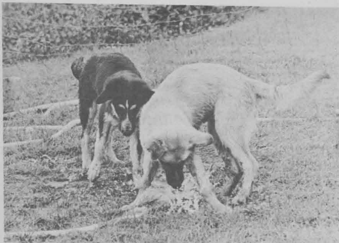
Literally proving the old adage that this school is going to the dogs, two canines attacked leaky hoses earlier this week during the recent warm spell.