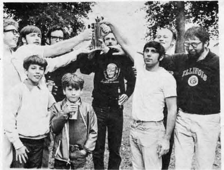
In a hard fought, come-from-behind victory, the physics department faculty smashed a team of physics students, 30-12, in the first annual Faculty-Student Einstein Cup touch football game. The students discounted the loss, claiming that it was not relative.

Next week the 20th ranked Tigers put their 2-1 record against Oklahoma State Sooners in Stillwater.