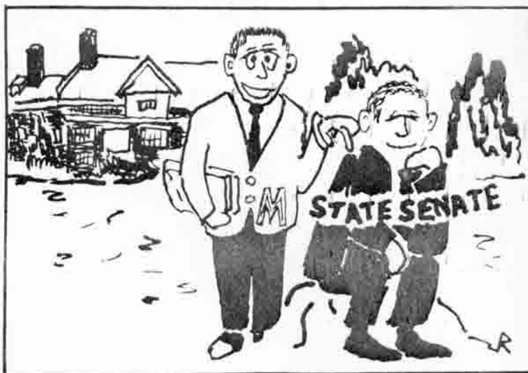
Hurry Up, Its Getting Late

These corrupt individuals are undermining . . . . . (Oops, someone just stole our typewriter.)