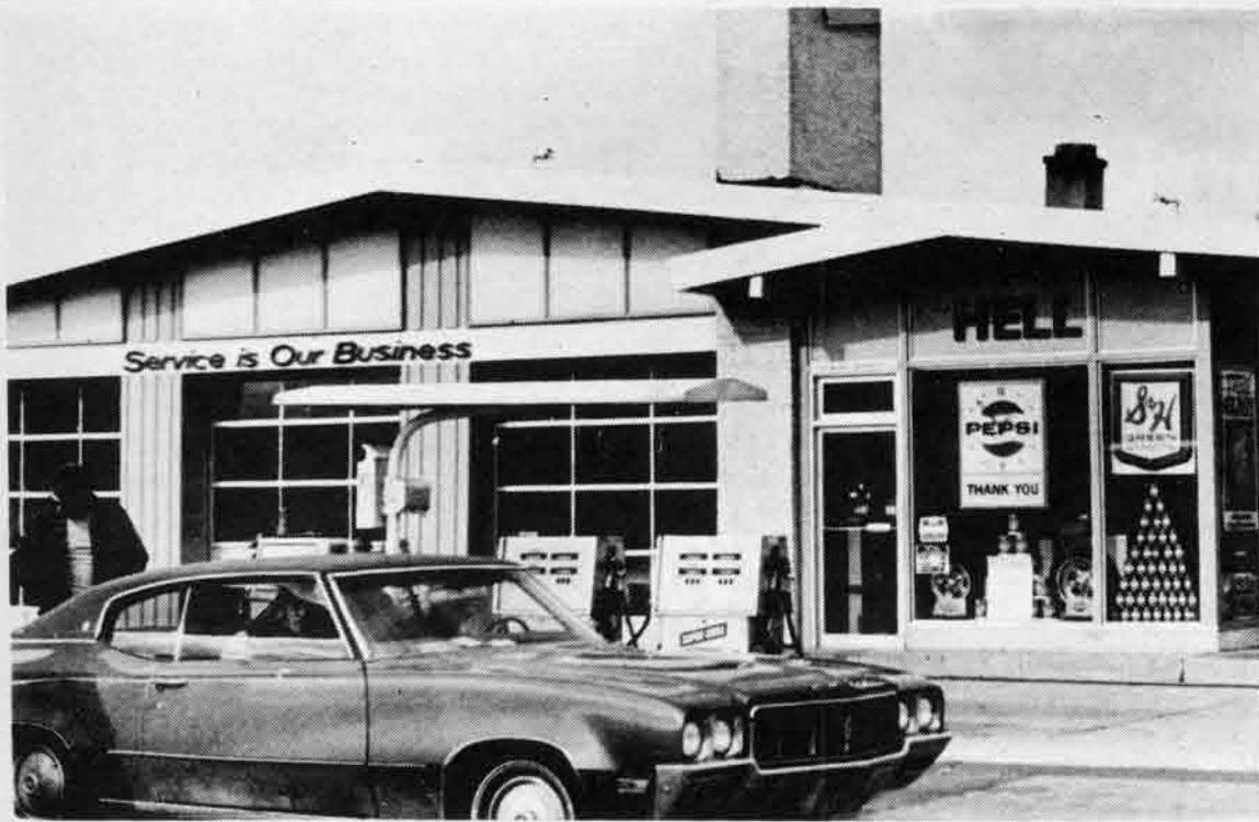
A service station owner in the north Chicago suburb of Wilmette, observed by members of the Steamers Club last weekend, offers perhaps his observation on life in the big city or on the gasoline trade in general.