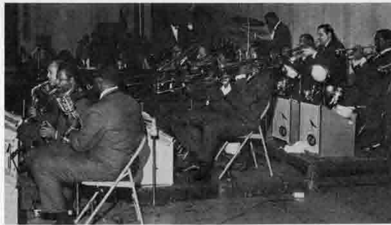
Count Basie's Band entertained after the UMSL vs. McKendree - Hawks double-header at Kiel Auditorium Dec. 8.

Christmas Ball, Mosley Electronics Hall.