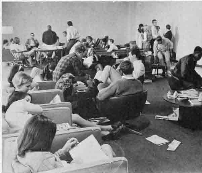
Condition of Benton Hall Lounge requires action. See editorial, page 2.

Student Union Board will sponsor a Christmas Ball Tuesday night, December 19, from 8-12