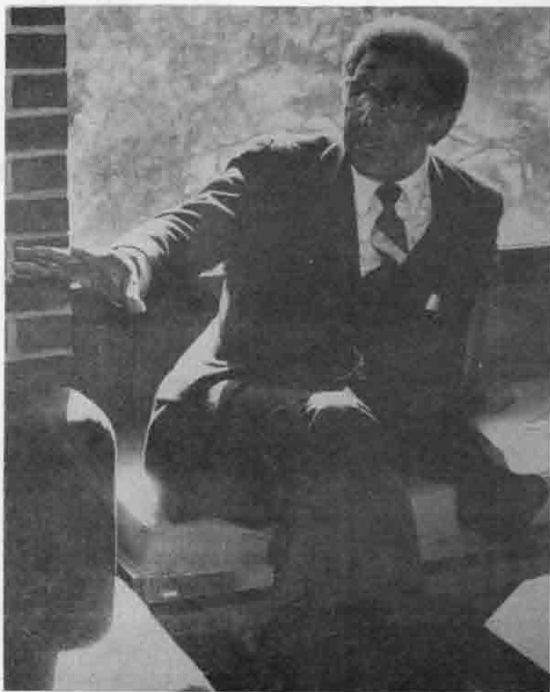
REACHING OUT: Joseph Lowery, President of the Southern Christian Leadership Conference, spoke to a group in the Black Culture Room on Oct. 30.