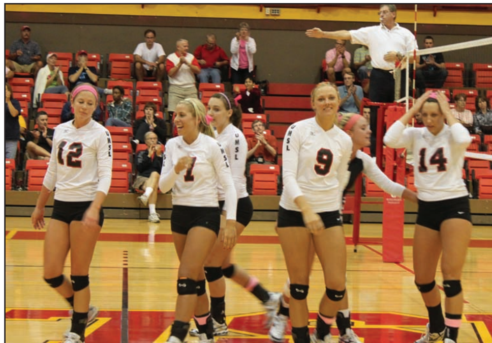
UMSL Women's team got a point in the ending session of the match.

ness month did not start until October 1, the women of ZTA raised over $10,000 on September 25 through their Stand Up and Cheer for the Cure event. The money ZTA has raised for Komen for the Cure already this year surpasses their total fundraising for all of