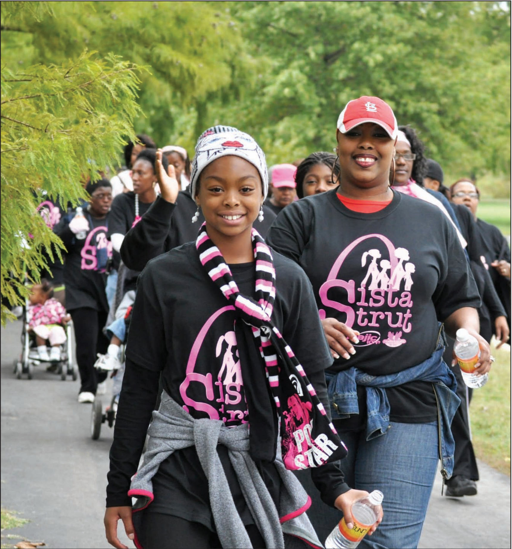
People wanting to spread awareness about breast cancer in the African American Community attend the Sista Strut Breast Cancer Walk on Saturday, October 2 in Forest Park.