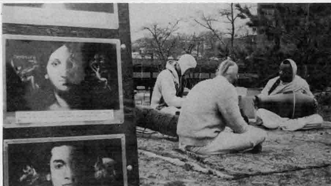
VISITORS FROM THE EAST: Members of the International Society for Krishna Consciousness chant before a group of students standing outside the University Center March 25. The Krishnas visit the UMSL campus to pass out a free magazine and invite people to come to their Sunday feast.