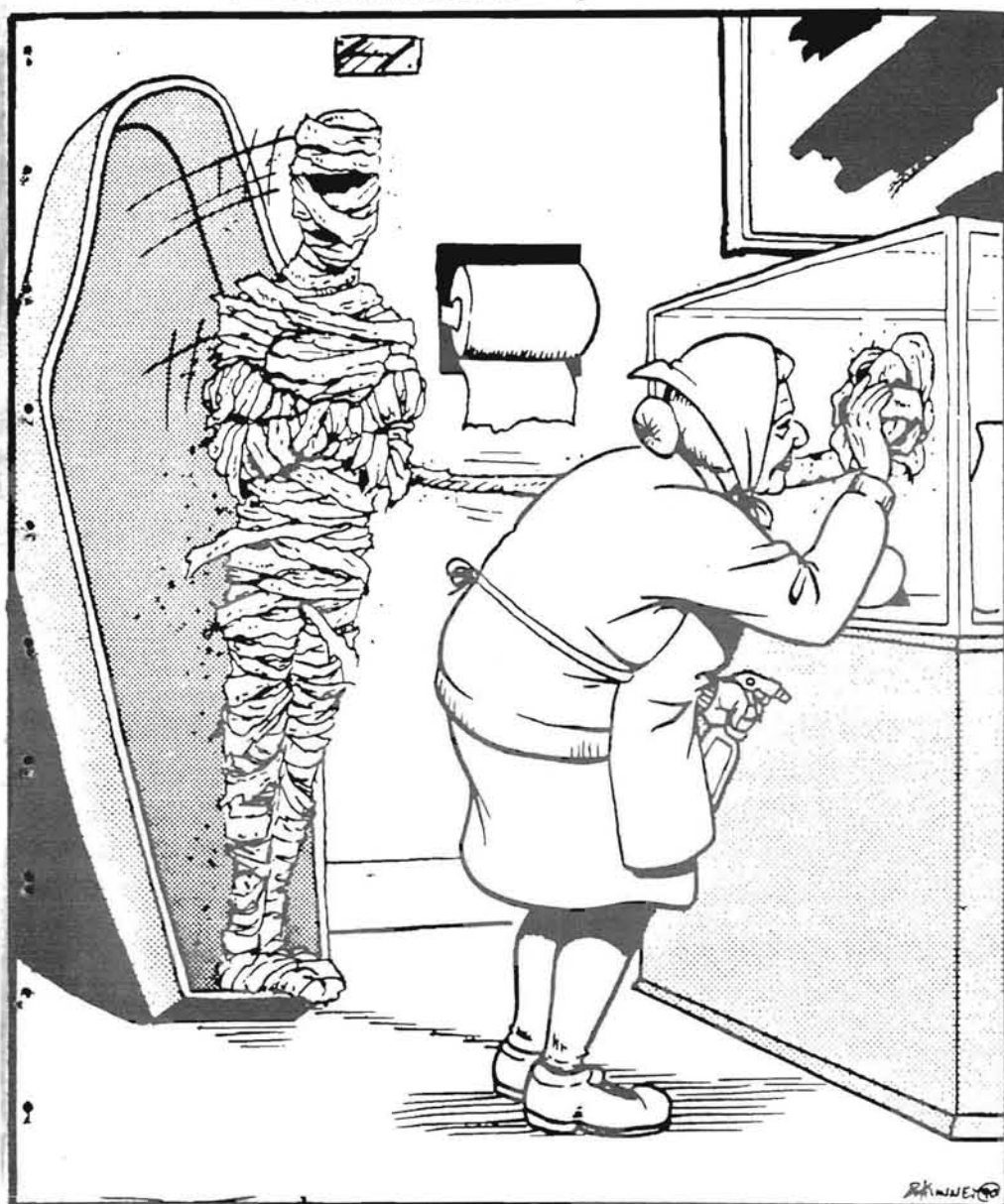
• Delphina had inadvertently defiled the tomb of the mummy of Damkilim and had brought a curse upon her first born.

The Stagnant is published weakly, or whenever we get around to it.. Advertising rates are available upon request by contacting the Stagnant business office. Space reservations for advertisements must be received before publication