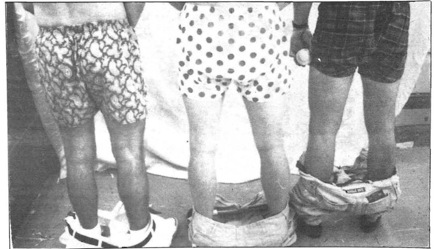
CAUGHT WITH THEIR PANTS DOWN: SLUM baseball players allegedly greasing bats and balls in Mark Twain locker room.