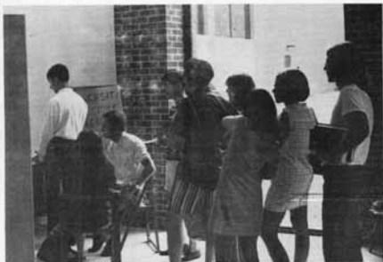
An hour spent in the bookstore's buy-back line last week was just about average.