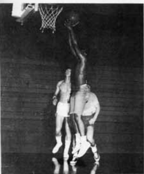
Students have made immediate use of the athletic facilities made available by the opening of the new fieldhouse. The new building has necessitated enlargement of the athletic department staff.