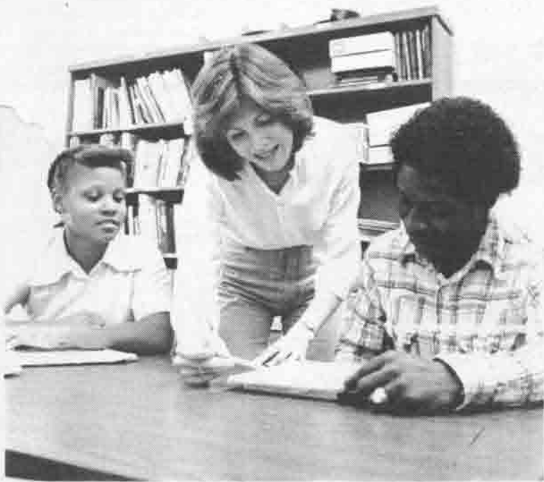
HELPING HAND: One of the Writing Labs instructors, aids students with necessary skills.

The Writing Lab also offers free workshops to the students. For more information on exact dates and times, visit the lab—SSB tower, Room 409B; or call 553-5950.