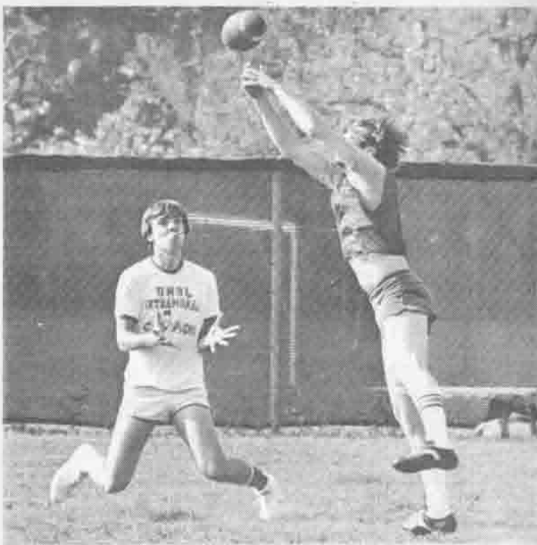
SPLIT END: Two players in this past Tuesday's Intramural football action go after a long pass. The wide receivers play an important part in Intramural play, in that most of the touchdowns were completed by hard thrown bombs.