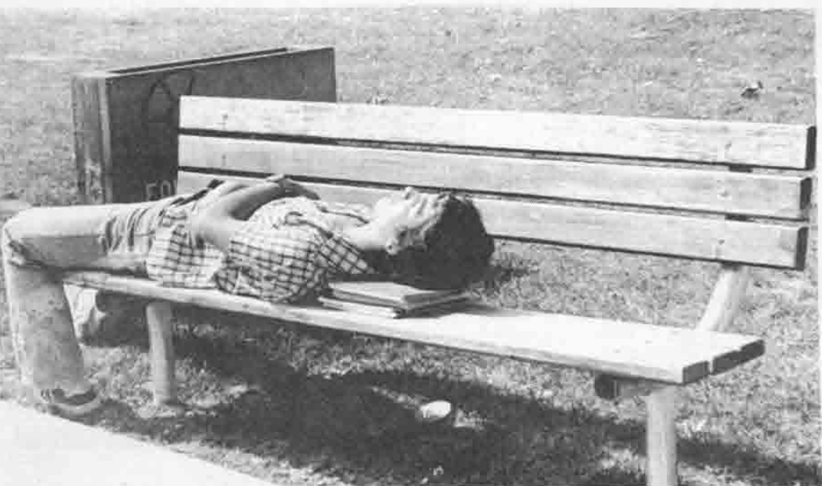
A LEADER AMONG MEN: An unidentified UMSL student shows one way that the new benches in the commons could be utilized. The benches were paid for by private funds.