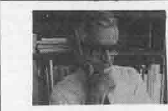
A dazzling recital