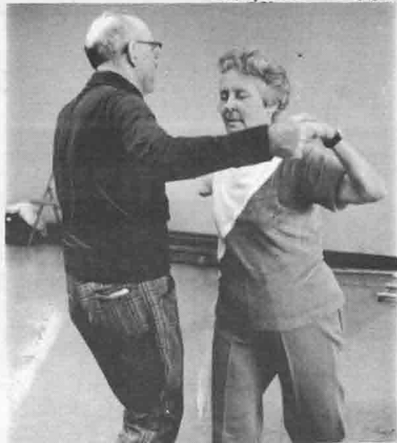
DANCE LIKE A BUTTERFLY: Two older adults dancing the butterfly during one of the older adult activity programs offered at UMSL. Older adult programs are offered every Tuesday, Thursday, and Saturday through Dec. 8. Additional information about the programs can be obtained by calling 553-5226.

He also suggested that student fees be adjusted annually to reflect increased costs incurred because of inflation, salary raises, or other increased expenses. He said that the cost to the student, "should not be immune to those real fluctuations that affect the cost of instruction."