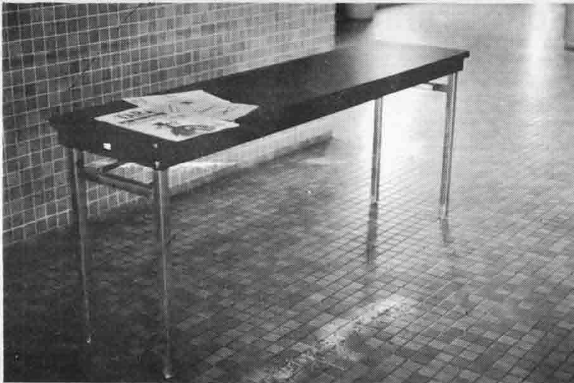
NO VOTES ALLOWED: Students on the Marillac campus were confronted by an empty table when they attempted to vote Tuesday between 9am and 1pm. Only one person had signed up to work the four-hour period, and he never showed up.

To register, or for more information, call UMSL Continuing Education-Extension, 553-5961.