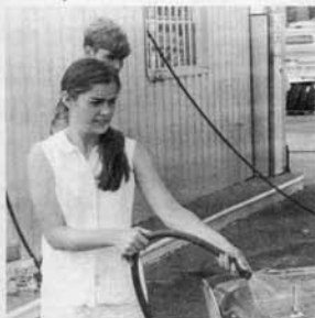
Angel Flight was out to clean up last Saturday when they held their car wash.