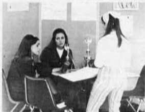
The Angel Flight Rosh table.

"They are determined to find some means of continuing to identify, encourage and assist young people with these qualities in preparing for careers appropriate to their talents and society's needs."