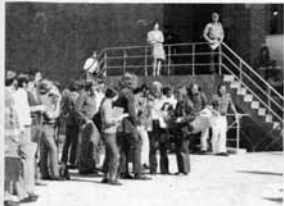
A crowd gathers during a CEW rally last week.