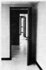
The labyrinth lives again in the new Arts & Sciences building.