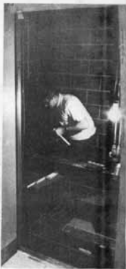
Elevator, elevator, we got the shaft!