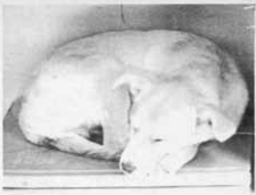
"Let sleeping dogs lie," might be the motto of this lost puppy which has adopted the campus and kept cameras clicking.