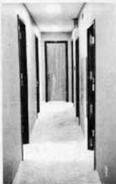
(top and right): Some rooms in the Tower are more complete than others.