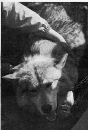
Jethro, a pale gray timber wolf strikes a classic pose for the Current photographer. The lone jack wailed little time in leaving after he took the shot, but his fear was unjustified, as the wolves were passive (and they were in chains).