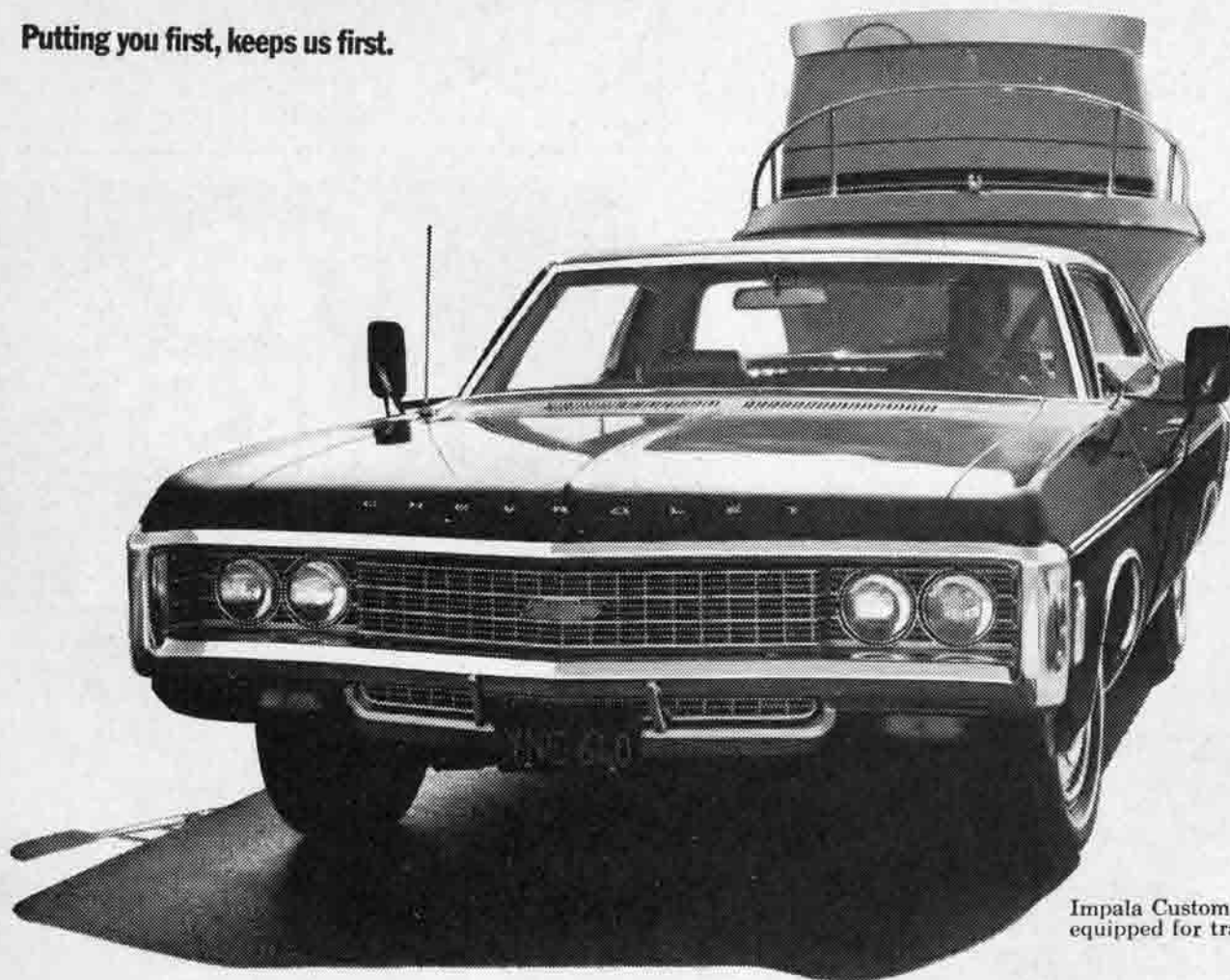
Impala Custom Coupe equipped for trailering

If Chevrolet can't haul it, maybe you'd better leave it.