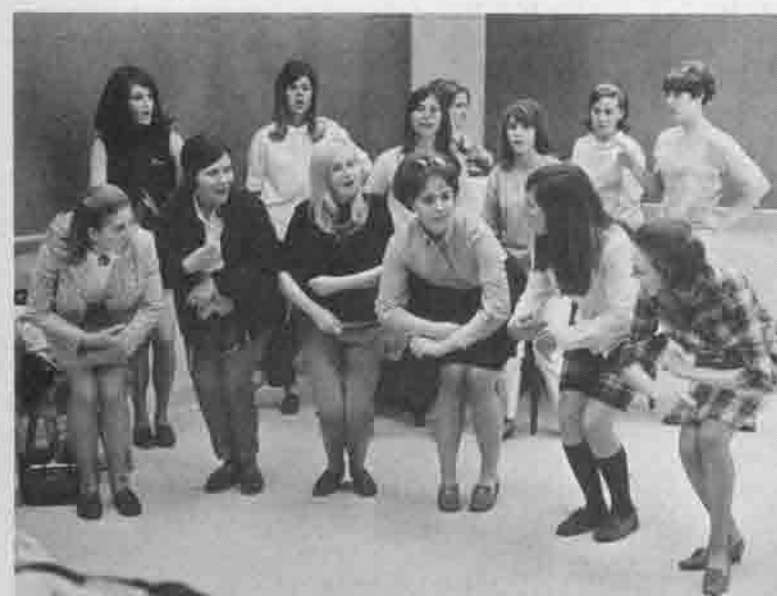
Sing along with Alpha Xi

So Alpha Xi's will be quite busy as well as having lots of fun.