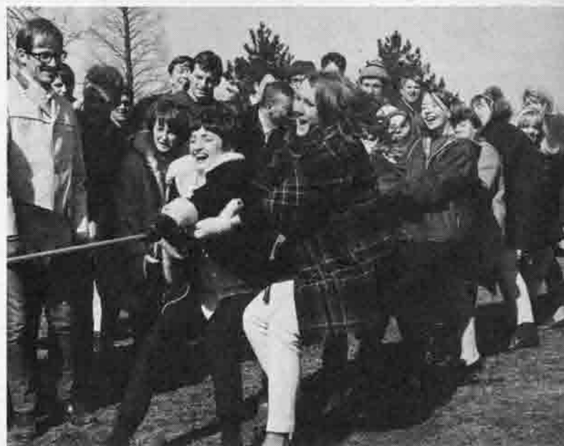
The girls perform feats of strength in the '68 Greek Games.

was also conducted by the I.G.C. The remainder of the council's efforts have been concentrated upon providing UMSL with the second annual Greek Week.