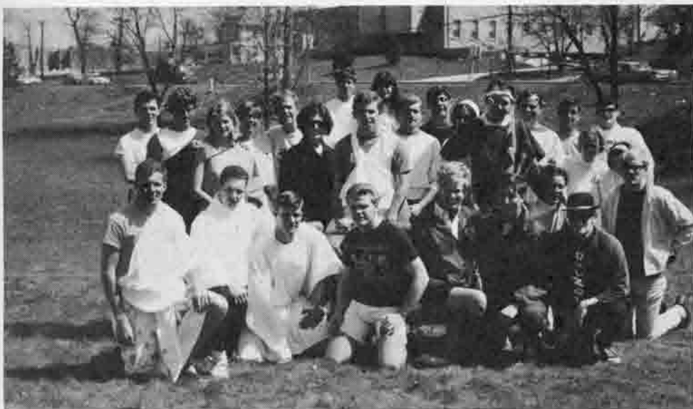
Sigma Pi - Greek Week Champs, 1968.

The UMSL colony of Sigma Pi Fraternity received their charter on April 12, 1969. The installation was performed by the National Officers of Sigma Pi, at the Masonic Temple in Clayton, Missouri. This marked the one-hundred and first chapter of Sigma Pi and the second social fraternity in the Inter-Greek Council to receive their charter.