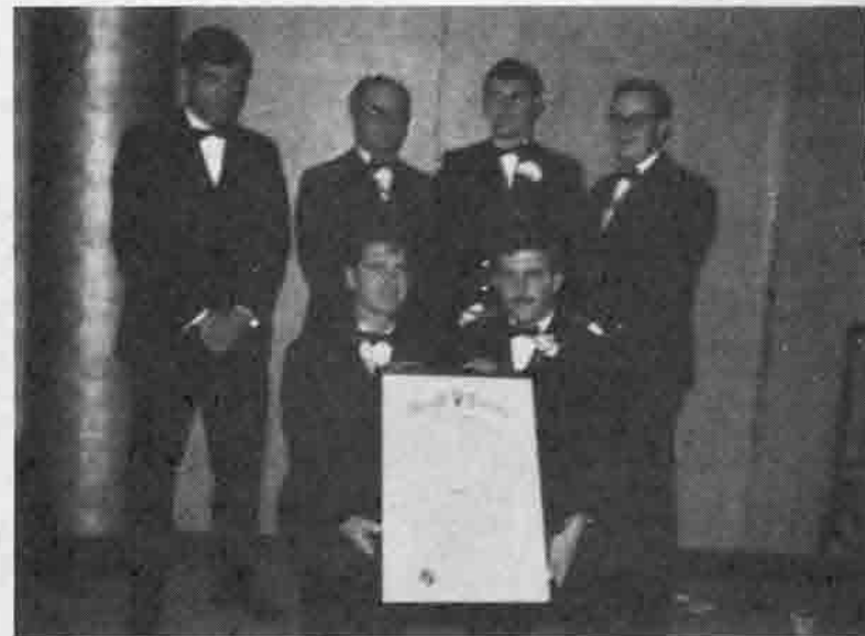
Installed officers of Sigma Pi.

Following the installation ceremonies, a banquet and dance were held at the Sheraton-Jefferson Inn.