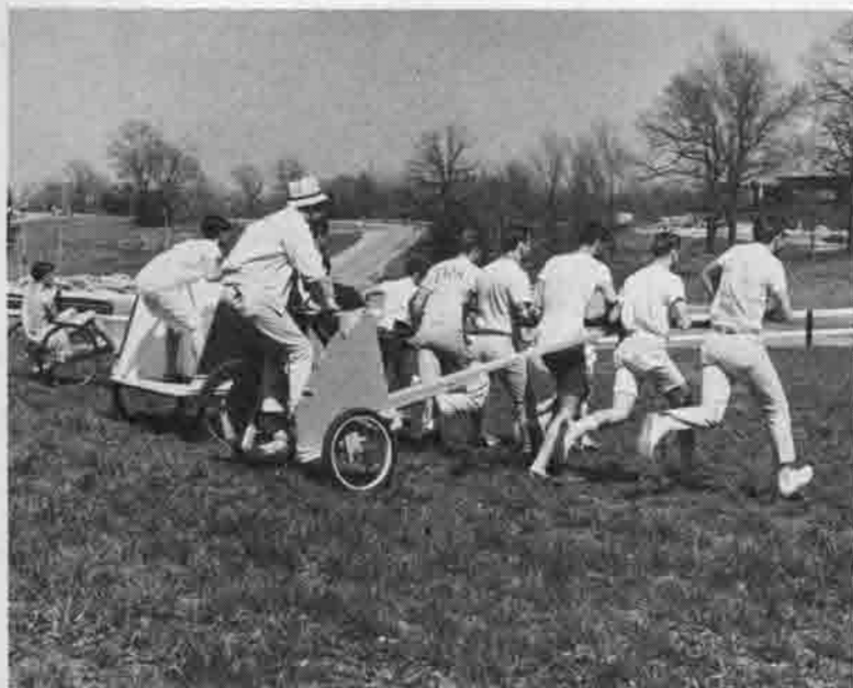
Engineering and physical powers are tested in the Chariot race.