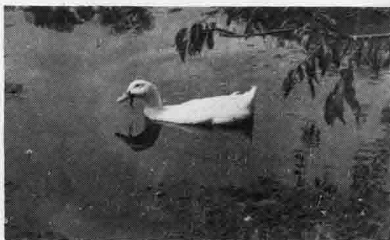
Fall can be lonely for some; this little fellow spent the afternoon looking for somebody to be with.

MoPIRG was started through the urging of Ralph Nader who believed that students could have an impact on state and local affairs, in the same way that Nader groups in Washington affected national affairs.