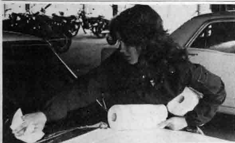
Last week's Angel Flight window wash

As to his prospects for seeking state office in '76, the 29-year-old said definitely, "It's a possibility."