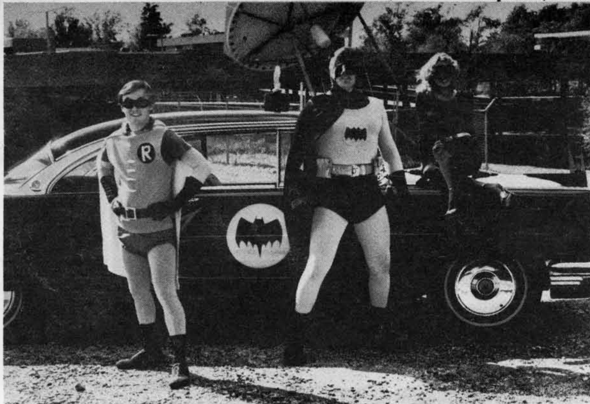
WE'RE TOUGH: UMSL Student Patrol members show off their new uniforms. The purpose of the change, one members said, was "to make us look like real crime fighters."