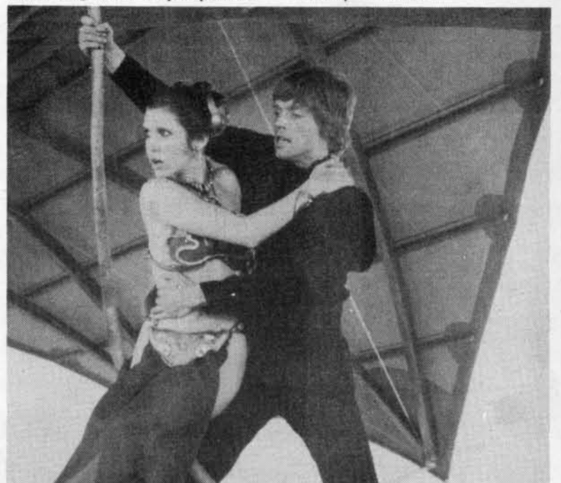
TO THE RESCUE: Luke Skywalker rescues Princess Leia from the evil Jabba the Hutt.

$1.00 UMSL Students $1.50 General Admission