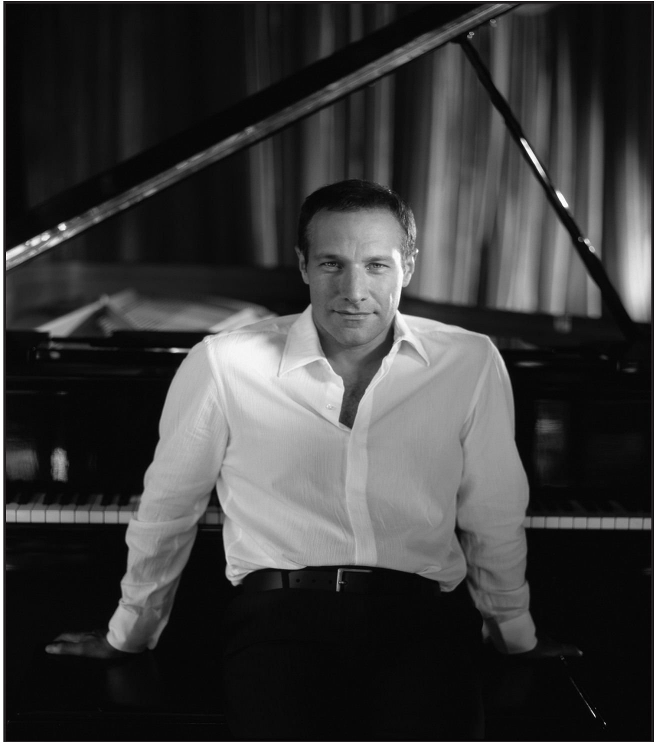
Jim Brickman played at the Blanche Touhill Performing Arts Center on November 26.

Cochran showed her true colors after intermission when she had a vocal