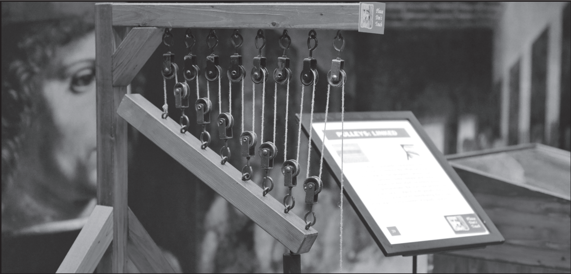
A reproduction of Da Vinci's invention, the pulley system, is on display at the Da Vinci Machines Exhibit in downtown St. Louis.

Your weekly calendar of campus events. "What's Current" is a free service for student organizations. Submissions must be turned in by 5 p.m. the Thursday before publication; first-come, first-served. Listings may be edited for length and style. E-mail event listings to thecurrenttips@umsl.edu , with the subject "What's Current." No phone or written submissions.