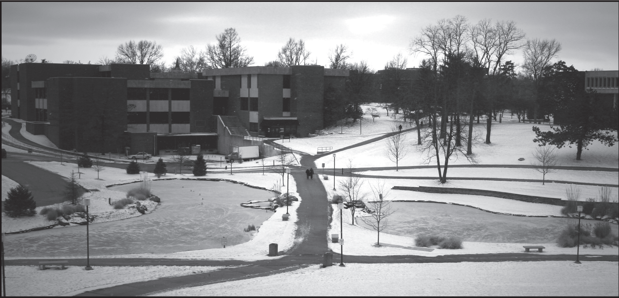
This week, UMSL’s campus was covered in the first big snow of the winter.

Your weekly calendar of campus events. “What’s Current” is a free service for student organizations. Submissions must be turned in by 5 p.m. the Thursday before publication; first-come, first-served. Listings may be edited for length and style. E-mail event listings to thecurrenttips@umsl.edu , with the subject “What’s Current.” No phone or written submissions.