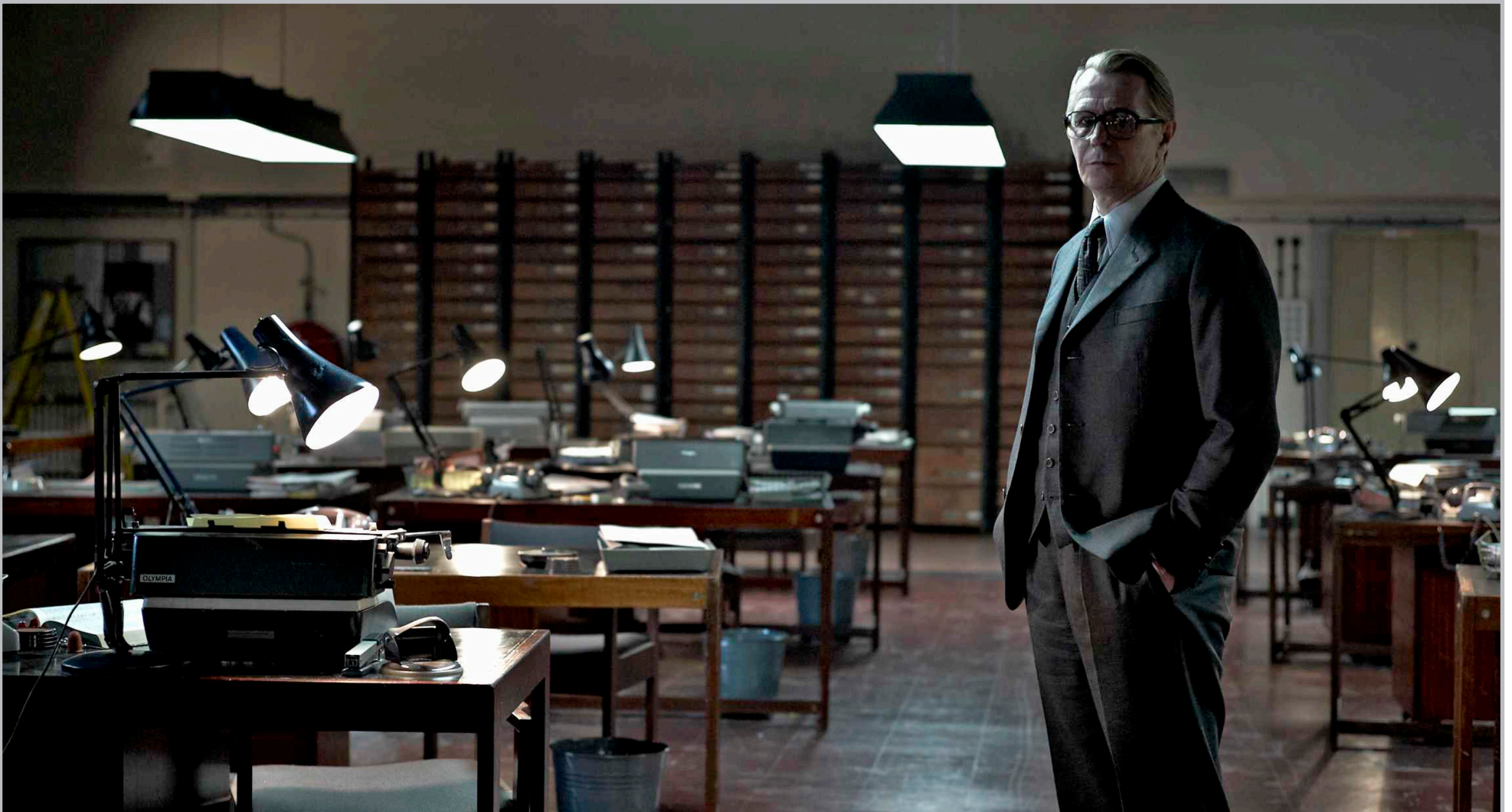
Gary Oldman stars as George Smiley in Focus Feature's release of Tomas Alfredson's TINKER, TAILOR, SOLDIER, SPY .