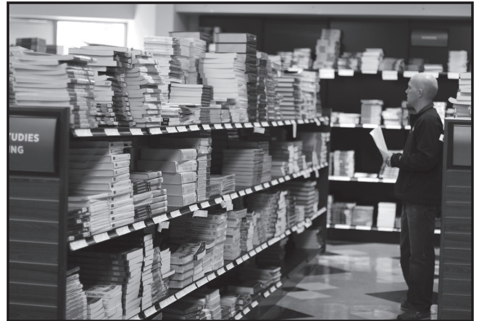
A student searches for books on his list in the UMSL bookstore.

The earliest you can start your cheap book search the more fruitful it will become. Checking the school and local libraries can prove to be the most cost-efficient way to prepare for your courses and offers the option to request copies from other