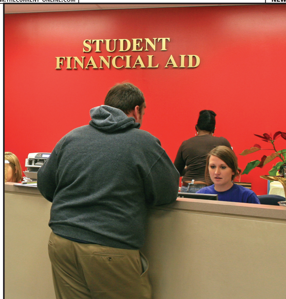
Student loan legislation has changed for the better.