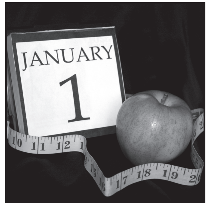
The number one resolution for 2012 is losing weight and getting in better shape.

Less than ten percent of Americans successfully complete their New Year's resolutions. Incredibly enough, gyms make the most money during the first three months of the new year. The most surprising fact, actually, is that many people give up their resolution before January ends!