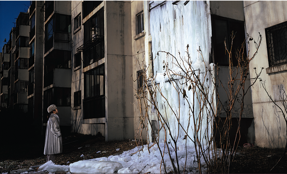
Yeondoo Jung, Korean, born 1969; Location #4, 2006; chromogenic print; 48 x 60 1/2 inches; Courtesy Tina Kim Gallery and Kukje Gallery © Yeondoo Jung