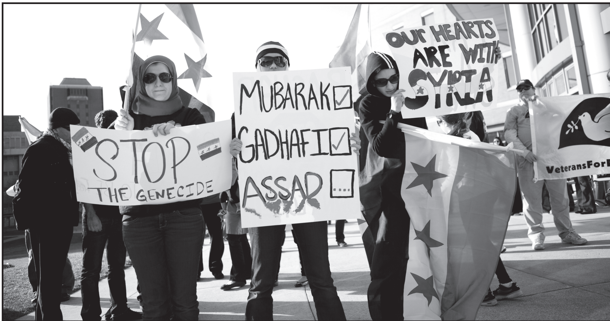
Protestors gathered two weeks ago outside the MSC to support Syria.

The concert on March 1 was the University Jazz Ensemble's first performance for the spring semester and the first student performance for the Touhill Performing Arts Center's 2012 program. Upcoming student concerts include the University Wind Ensemble on March 21, a Piano Studio recital on April 11, and the University Community Chorus on April 24. The University Jazz Ensemble will also perform at the Greater St. Louis Jazz Festival on April 20 and 21.