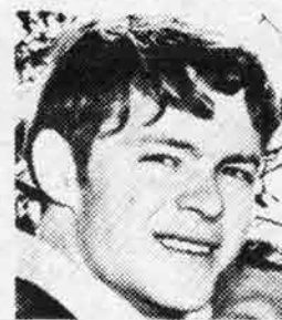
I do want to do something.

If you keep saying you want to do something with your life — here's your chance to prove it