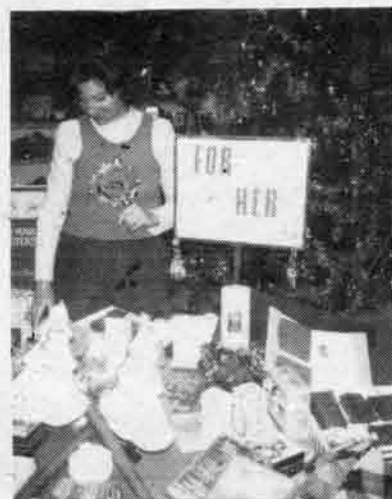
Him and Her collections include binoculars, radios, tape recorders, calculators, jewelry, watches, jackets, shirts, sporting goods, games, wallets, umbrellas, gloves, scarfs, hats, belts and pen and pencil sets.

STOP IN BETWEEN CLASSES OR ON YOUR LUNCH BREAK TO CHOOSE FROM OUR WIDE VARIETY OF GIFTS AND RETURN LATER FOR A BEAUTIFULLY WRAPPED PRESENT