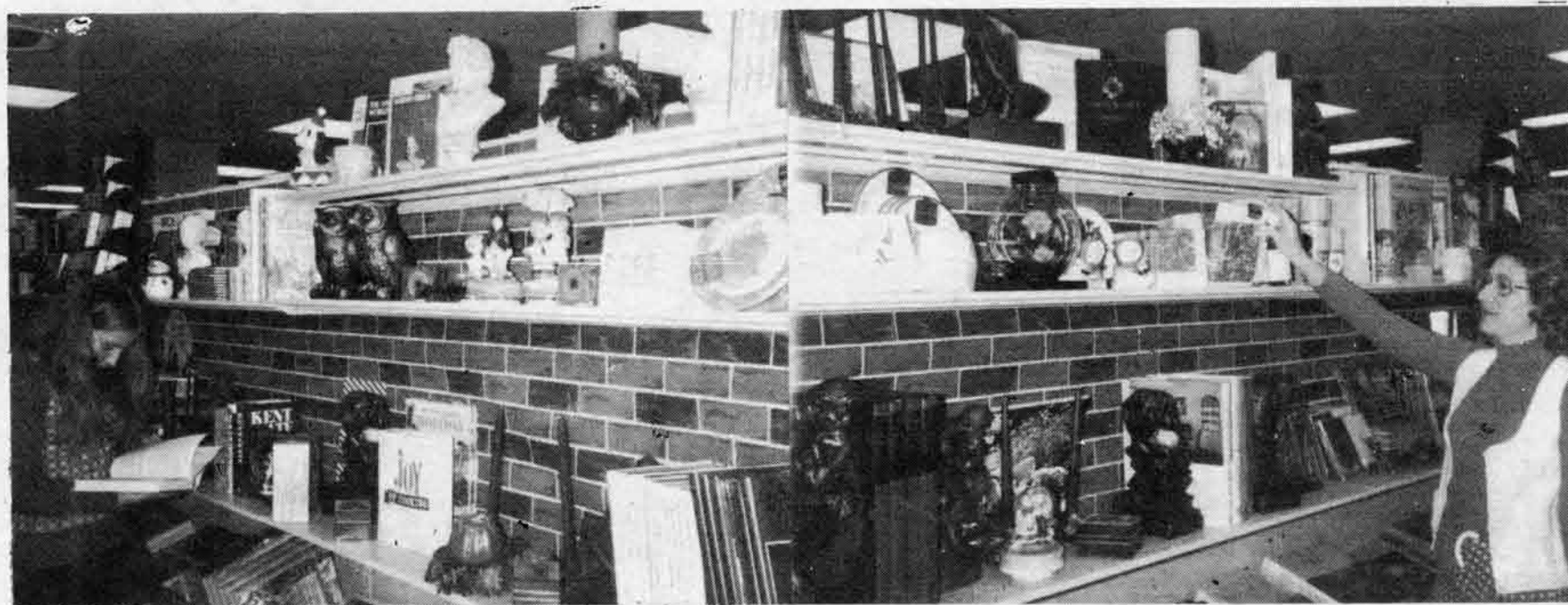
Gift Center features statues, candles [holiday, novelty, traditional], music boxes, straw flower arrangements, pictures, plaques, posters, stuffed animals, incense burners, gift books, holly hobby gifts, candy, cards, gift wrap and a large selection of budget gifts.

Master Charge and BankAmericard accepted