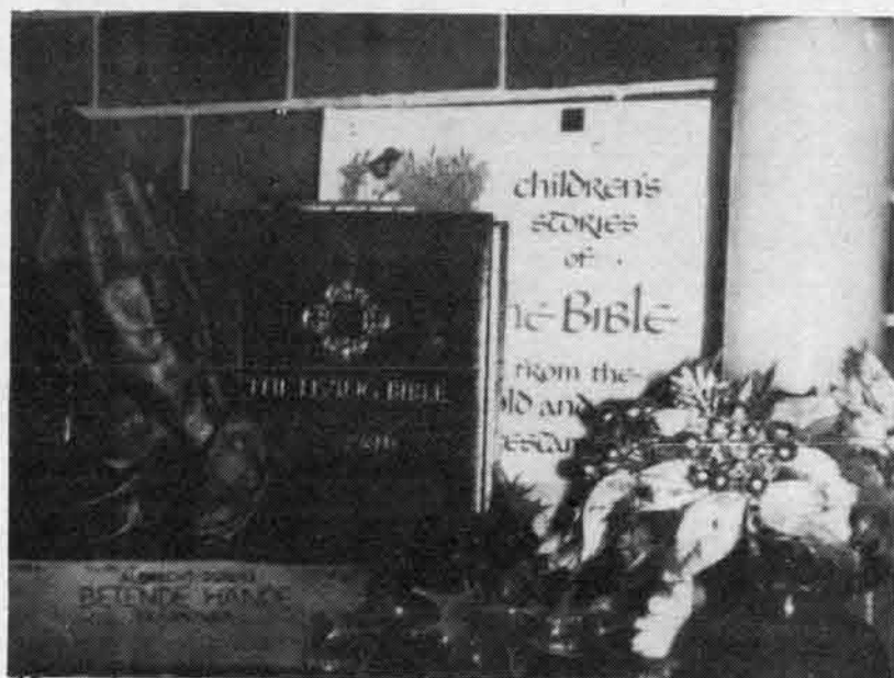
Full line of Gift Books including Bibles, children's books, cookbooks, special interest and hobby books.