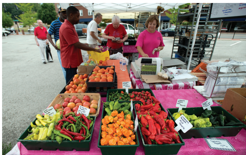
Ferguson Farmers Market has lots of local produce.