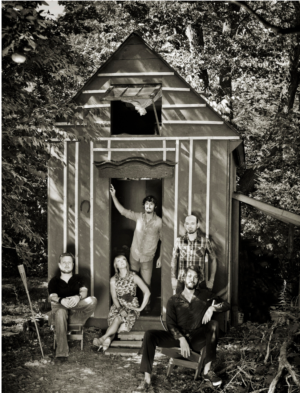
Headline act Murder by Death