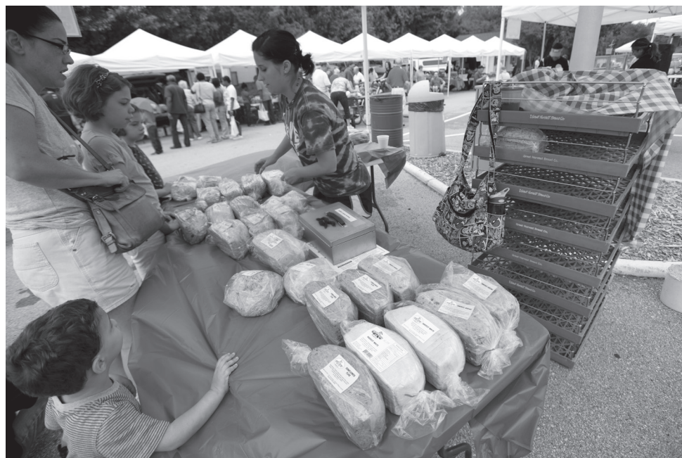
Ferguson Farmers Market sells local produce from small farmers.