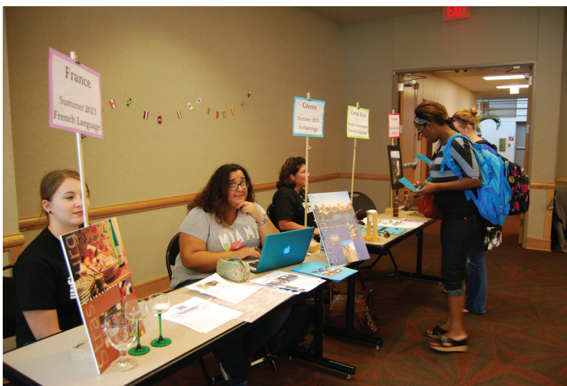
UMSL Study Abroad fair at Century Room C.