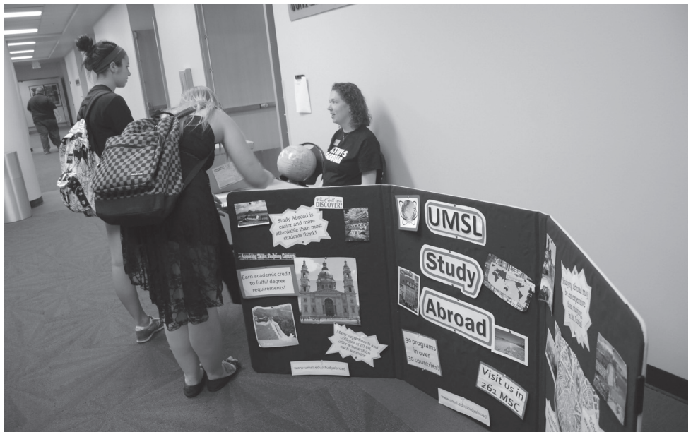
Visitors enter UMSL's Study Abroad Fair.

Students were encouraged to play as many games as they liked. Upon winning, they were presented with a choice of items from the prize table.