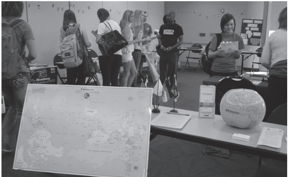
The upside-down map shows the perspective from the Southern Hemisphere.

Students who are interested in studying abroad are encouraged to stop by the Study Abroad Office located at MSC 261 or e-mail the office at studyabroad@umsl.edu .