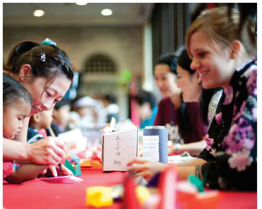
Japanese Festival at the Botanical Garden.

The cooking demonstration was also met with popular attendance. The informative and mouth