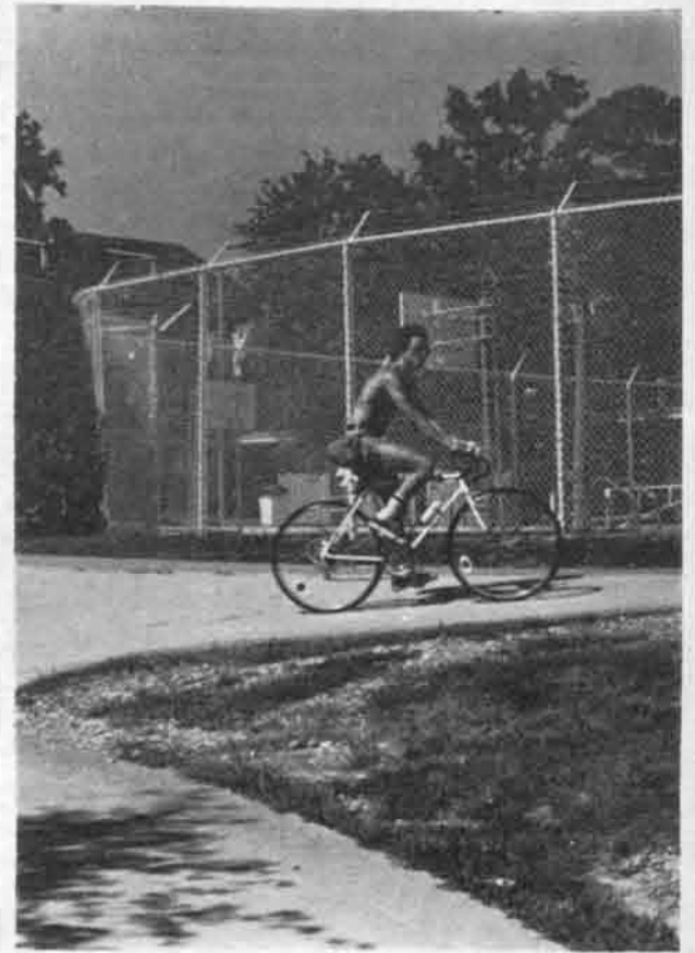
Bicycles have become increasingly more popular as a means of transportation. Can you wonder why?

Another hard winter coming up? Perhaps yes. But, even though the financial aid office is tucked away in a corner of the Administration Bldg., it is not that difficult to find.