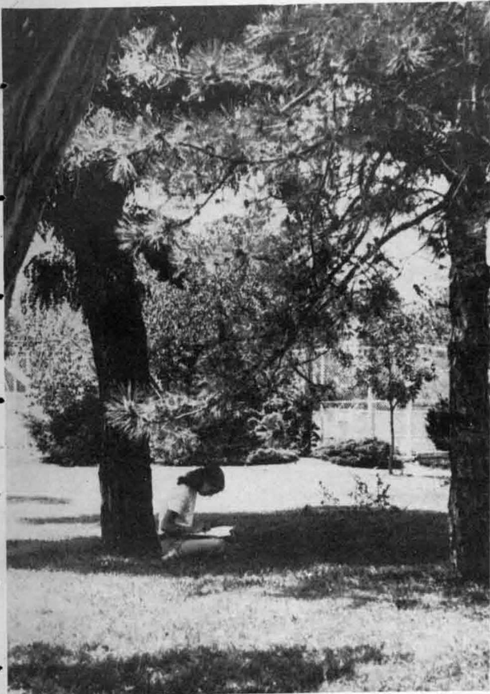
SUMMER STUDY: When the sun blazes and the St. Louis temperature spirals into the almost-100 degrees as it did often the past week, it's nice to have the cool buildings of the university in which to withdraw. Some summer students prefer not to retreat, however, as the girl pictured who prefers the campus green hues and studying in the shade.