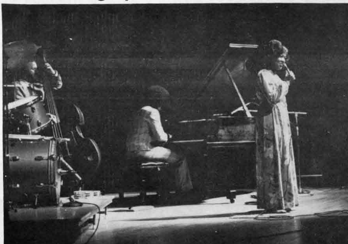
Members of the St. Louis Jazz Quartet entranced audience with not only jazz, but rock and blues as well.

Throughout the show, there existed a beautiful give-and-take between the artists and the spectators. Every song that they did up there was the truth and everyone could feel it. One of the guys sitting on the stage summed it all up in one line: "Whatever you sing, you're beautiful." Right on.