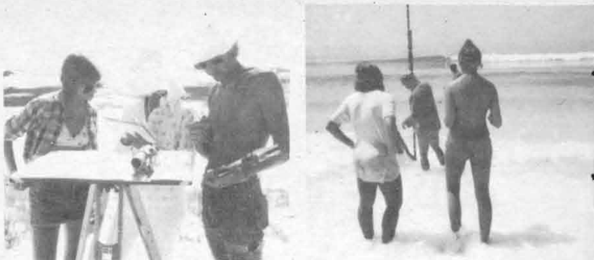
SEA SHORE STUDIES: 18 UMSL geology students investigated wave mechanics and beach movements on their recent trip to Santa

In discussing teaching, the thoughtful professor said, "Teaching is a difficult proposition. Each individual has to find a style that suits him. I'm not a great orator, though certainly I lecture. But," he noted, "I encourage interruptions from students. I don't feel a class is going well unless there are interruptions. Of course it can get out of hand. Some people are persistent in wanting to know the dietary habits of John C. Calhoun, or 'did Washington really have wooden teeth?' or, 'how much did William Howard Taft weigh?' But these are risks I'm willing to take."