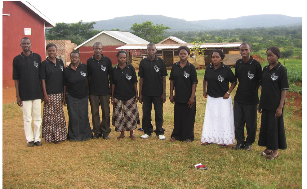
CAFOCOD Ugandan volunteers.