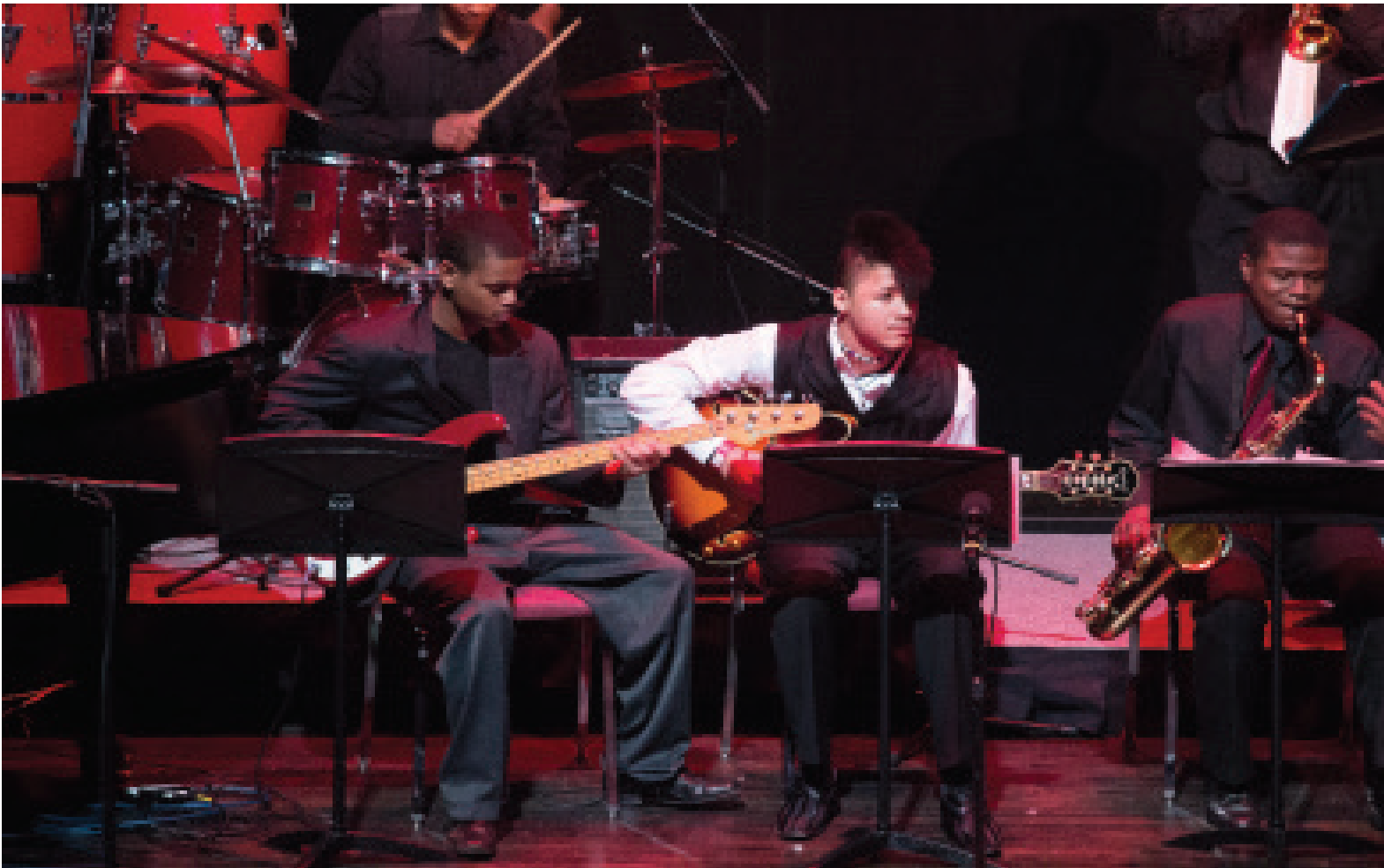
Normandy High School band performs at UMSL's Martin Luther King celebration 2013 celebration.