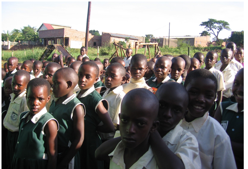
Orphans of CAFOCOD Educational Program.