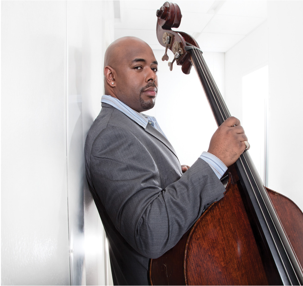
Christian McBride is one of the many artists featured at the Touhill this year.