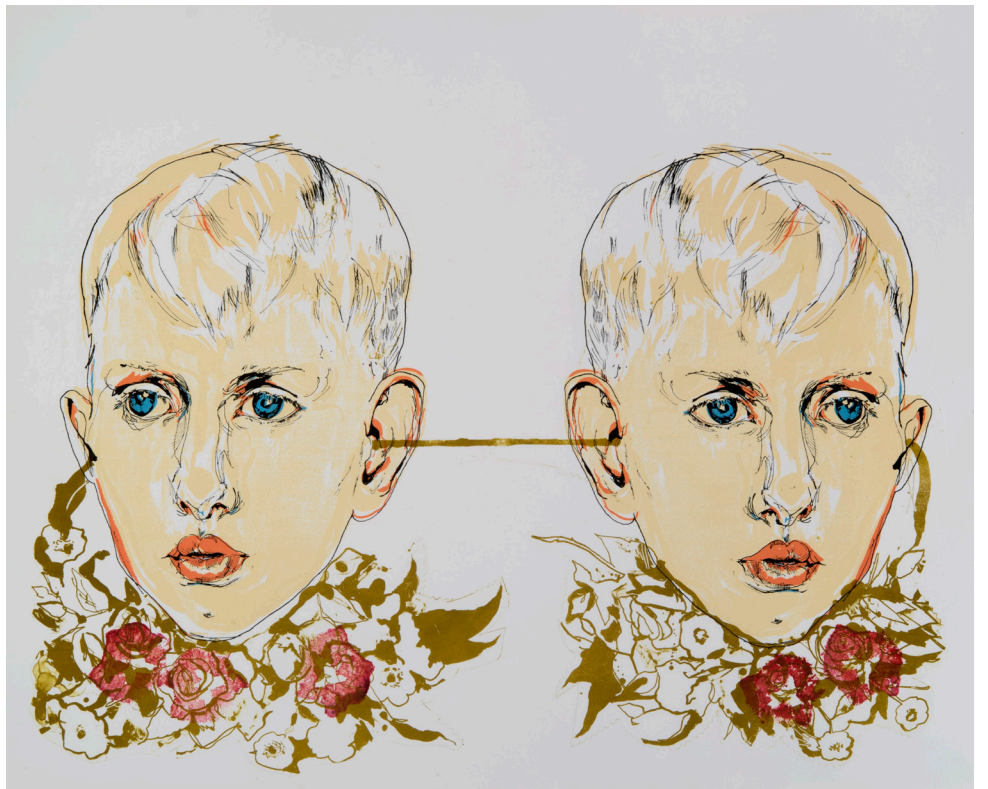
LACED is the first exhibit opening this year at Gallery 210.

Gallery 210 will host its regular "Parental Advisory" exhibit to showcase the work of faculty-nominated UMSL Bachelor of Fine Arts students. For the season's final series, local high school students from Central Visual and Performing Arts High School, Thomas Jefferson School and Hazelwood Central High School will contribute their works for the third installment of 210's "Collaborative" exhibition.