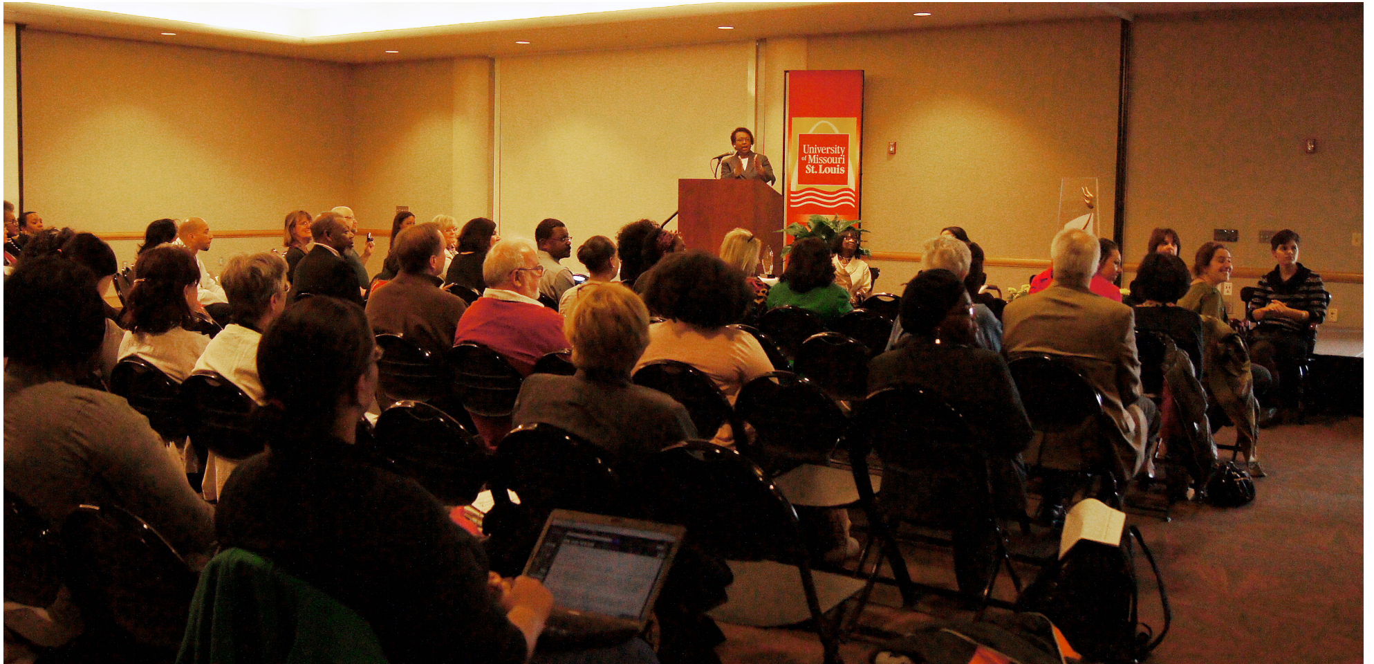
UMSL students and faculty gather for the Women Trailblazers Awards.