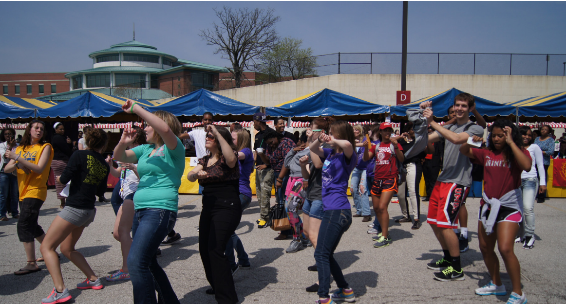
The Mirthday celebration in full swing.