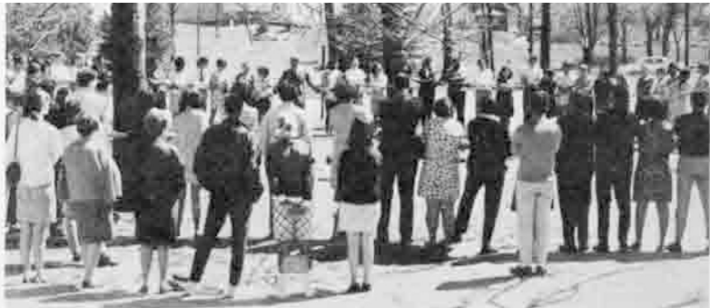
UMSL Students and faculty members gather on front lawn to mourn the death of Dr. King.

Augustin Hadelich included cadenzas composed by himself and about 20 minutes of perfectly memorized and sophisticatedly performed solo playing. He played the work with exceptional use of accents, energetic movements and application of various styles and techniques. Paganini with Hadelich has won the Gold Medal at the International Violin Competition of Indianapolis, Lincoln Center’s Martin E. Segal Award, an Avery Fisher Career Grant and the Borletti-Buitoni Trust Fellowship.