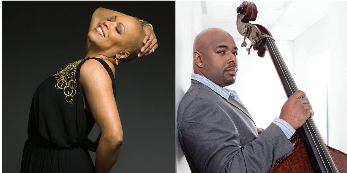
Monterey Jazz Fest on tour.