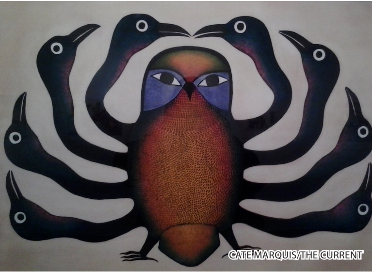
“Guardian Owl” by Kenojuak Ashevak, one of the pieces of Inuit art in “Cape Dorset Prints: The Kinngait Studios” at Gallery 210 through December 7.

Visit thecurrent-online.com for exclusive online content. This week: