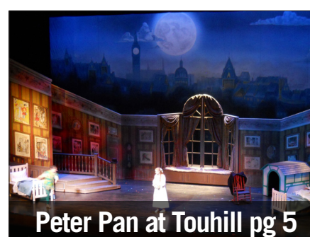
Peter Pan at Touhill pg 5