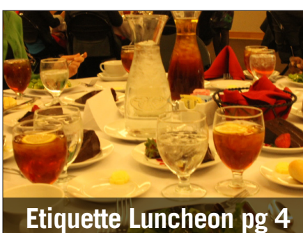
Etiquette Luncheon pg 4

The Great Pumpkin Jack-O-Lantern Competition The Nosh MSC offices and student organizations had the opportunity to sign up for this pumpkin carving competition, hosted by the Office of New Student Programs. Voting will take place in the Nosh on Halloween, so stop by the Nosh to check out the fun.