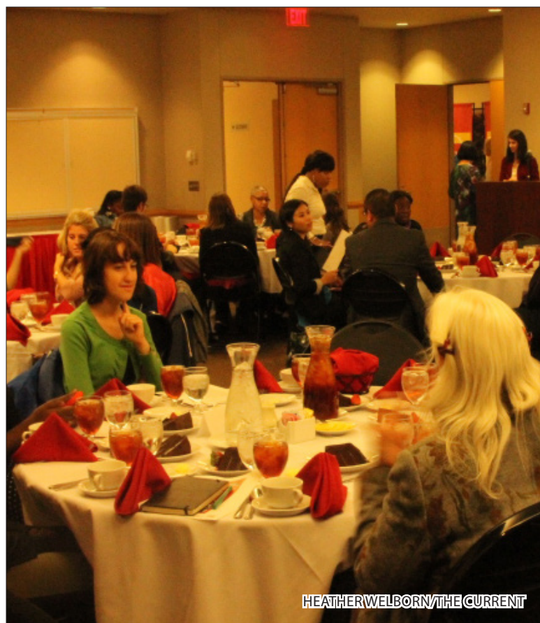
Diners enjoy a four-course meal