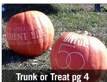
Trunk or Treat pg 4