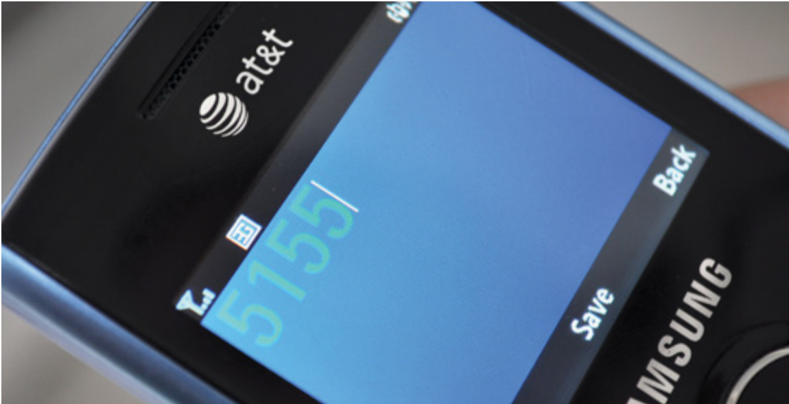
Campus police can be reached at 314.516.5155.

University of Missouri–St. Louis police were dispatched on October 24 at 3:00 p.m. to parking lot AA in response to an alleged robbery. The victim was a female UMSL student. According to a timely warning distributed to the UMSL community via email on October 25, the victim reported that she was walking from the UMSL North Metrolink Station to the Great Rivers Greenway Walking and Biking Trail before the alleged robbery was said to have taken place. The suspect was one of a group of three males wearing dark clothing that the victim observed to be walking along the trail. Upon reaching Lot AA near the Fine Arts Building, one of the men approached her, demanding her cell phone before taking it forcefully from her hand. The suspect then fled the scene on foot, heading north on the bike trail. The suspect has been described as male, approximately 6 feet in height, with short hair and a goatee. The suspect was also reported to have been wearing a black hooded jacket and dark pants at the time of the alleged incident. Any information regarding this incident can be reported to the UMSL Police Department at 314. 516.5155.