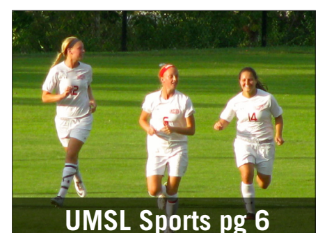
UMSL Sports pg 6