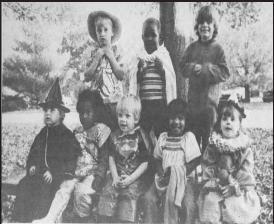
HOLLOWEEN SPIRIT: Children at the Marillac Day Care Center dressed in costume on Halloween day.

The Current has been a part of UMSL since 1966. In honor of the campus’ 50th anniversary, we are reprinting articles from years past. These Halloween photos originally ran on November 2, 1971, and November 4, 1982, respectively. For more Jubilee Flashback, visit thecurrent-online.com.