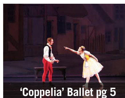
'Coppelia' Ballet pg 5