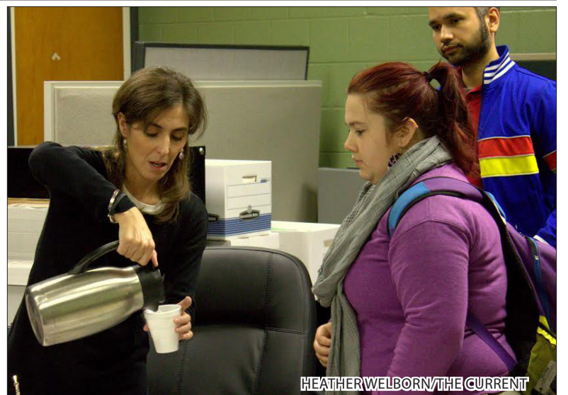
The campus community enjoys ethnic cuisine during Foreign Language Week