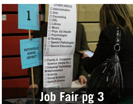
Job Fair pg 3