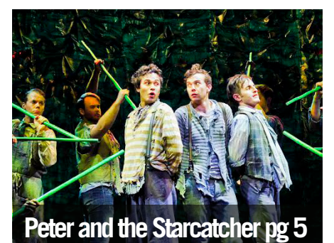
Peter and the Starcatcher pg 5