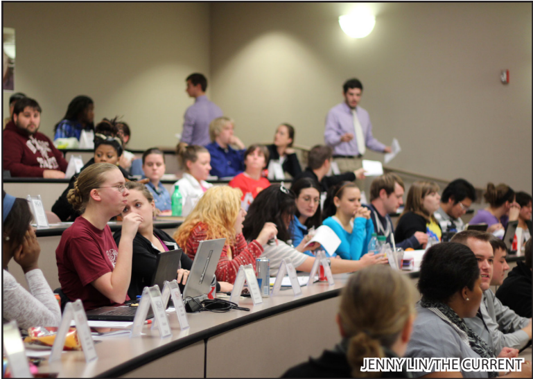
SGA Meeting

The first resolution recommends the addition of “gender identity and expression” to the language of the University of Missouri system’s non-discrimination policy. Similar resolutions are being presented by the other three UM campuses, demonstrating support for the policy update. The affirmative student recommendation will be presented at the Board of Curators’ meeting on April 10-11. The second resolution addresses the lack of lactation rooms for students. Currently, UMSL staff and faculty and staff have at least temporary access to spaces, other than restrooms, for lactation. Students do not have such designated spaces. Temporary spaces to accommodate such needs have been identified in Provincial House, Benton Hall, and in the first floor of the Millennium Student Center, but the resolution would provide for the inclusion of these facilities in the plans of new building projects as well as put into policy a mandate for such facilities to be made available in existing buildings. This resolution was drafted with the help of a student who had experienced some difficulty in obtaining such a space. Federal law currently mandates such spaces for employees; the resolution extends such support to students. Administrative approval and action are pending for both resolutions.