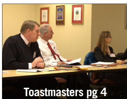
Toastmasters pg 4