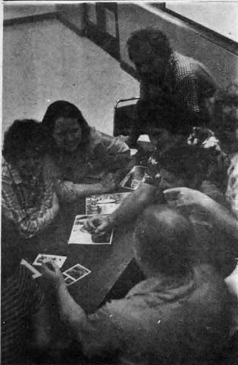
HISTORY IN MOTION: Students in History 390 discuss old family photos. The course emphasizes learning history through non-written documents.