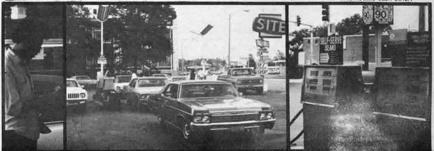
TIGHT SQUEEZE: High gasoline prices and severe shortages have created a tight squeeze for many UMSL commuters. Shown above are common sights at area gas stations.

"We're so used to freedom," Muller said. "We're all going to have to be forced to willingly give up some freedom so that we can accommodate each other."