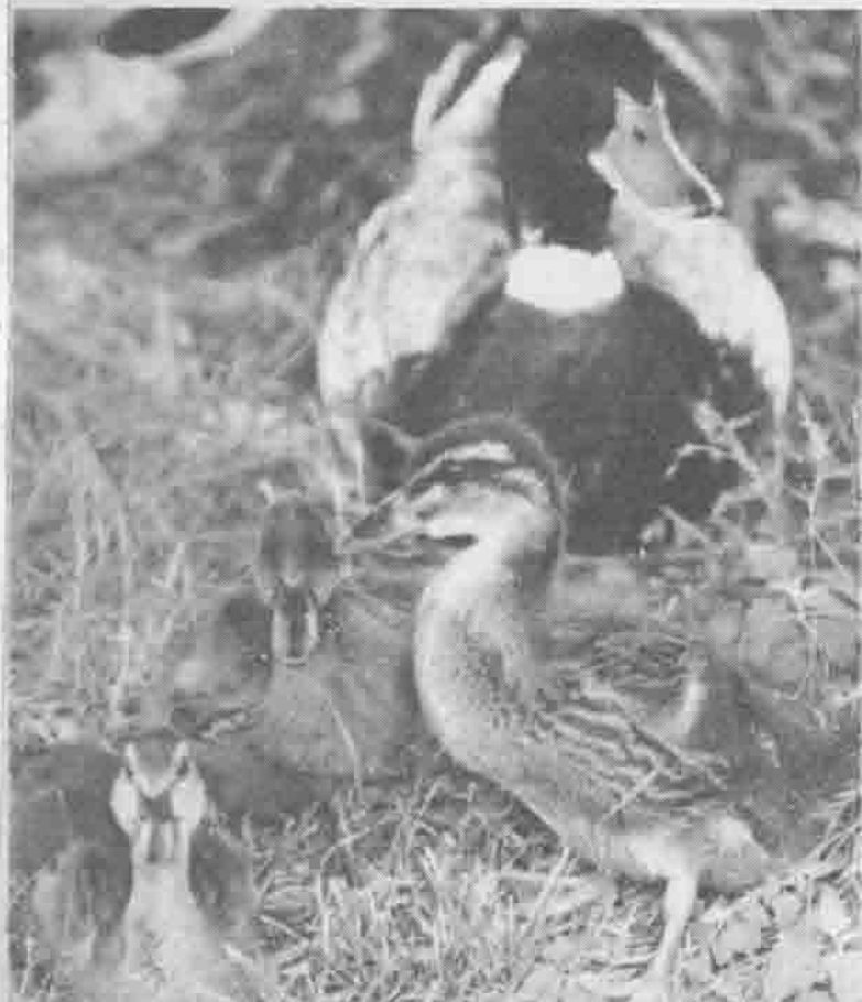
DOWN HOME: An UMSL duck gave birth to these ducklings last semester at Bugg Lake.