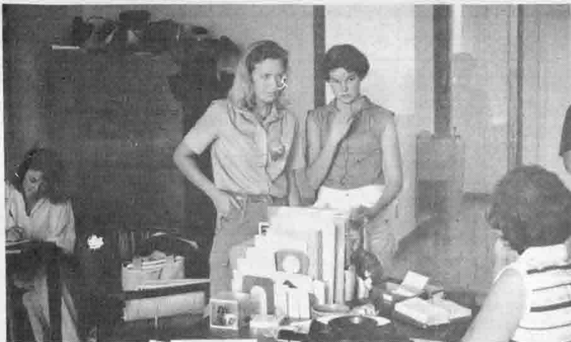
THINKING SNOW: UMSL students sign up Monday for ski trips to be held this winter. The trips are offered at discount