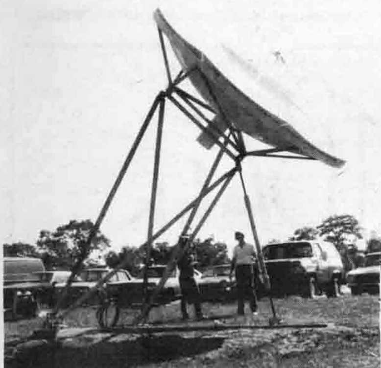
SPACE-AGE SIGHT: UMSL radio station KWMU will use this satellite dish installed east of Clark Hall to pick up a 24-channel supply of constant programming from the orbiting WESTAR I.